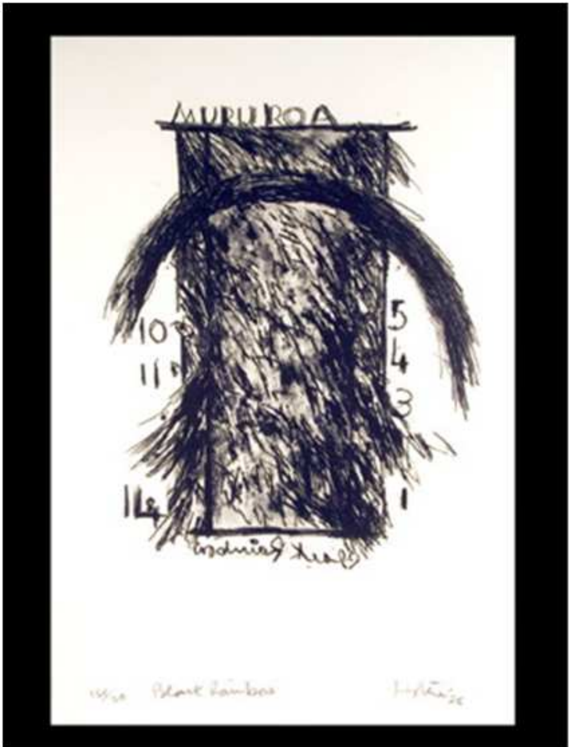
Figure 6. Black Rainbow . (1988). Ralph Hotere.