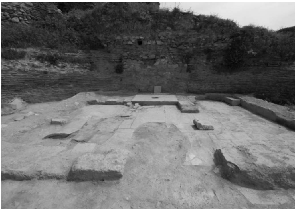
Fig. 4. General view of church II Nicaea.