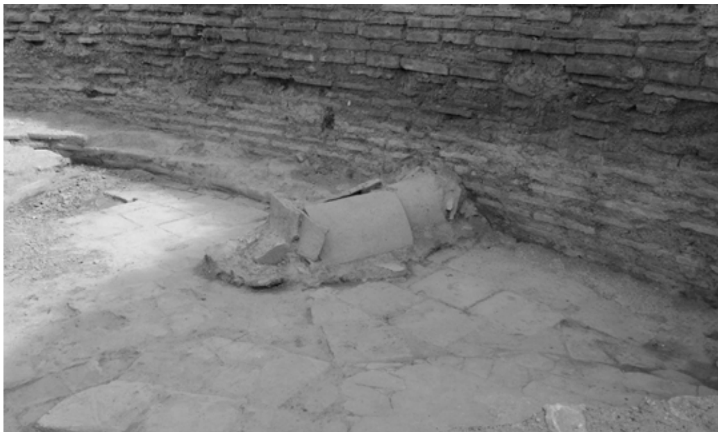
Fig. 3. A roof tile grave in church II Nicaea.