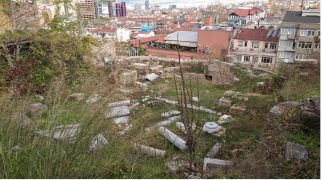
III. 37. General view of church ruins discovered in Prusa ad Olympum.