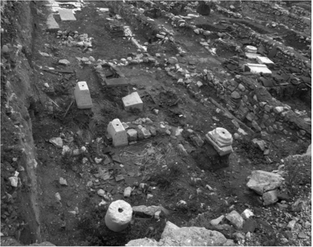
Fig. 7. Pedastals supporting a baldachino in church III Nicaea.