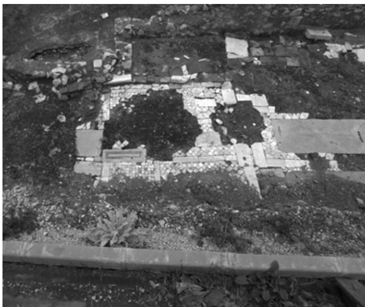
Fig. 5. Construction site of museum annex in Iznik — shops, water pipes, wells and alleys.