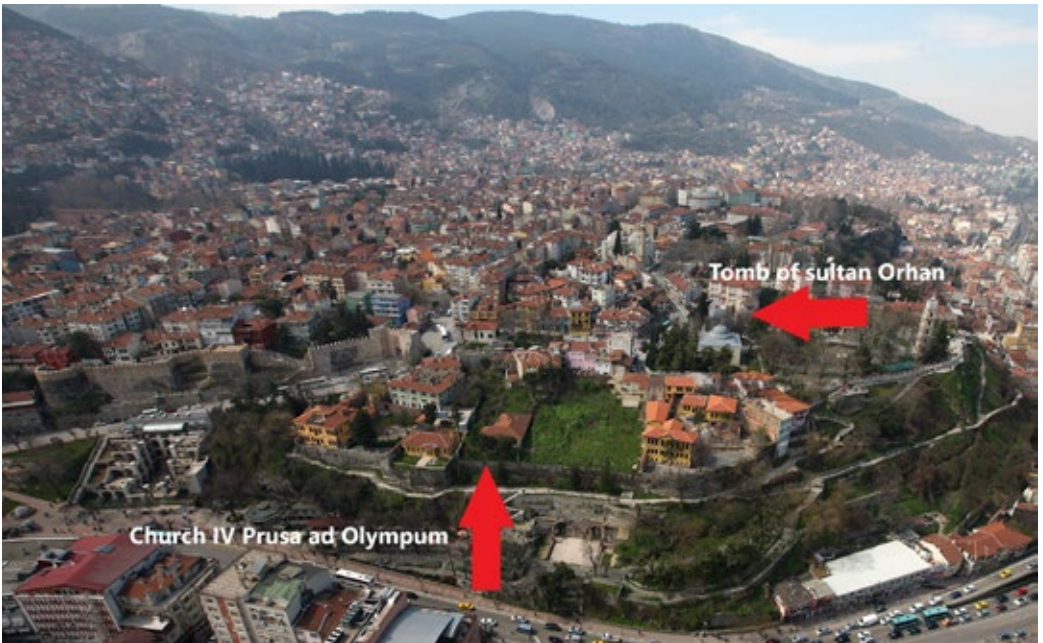
III. 38. Aerial view of church IV and mausoleum of Ottoman sultan Orhan which was formerly a Byzantine church.