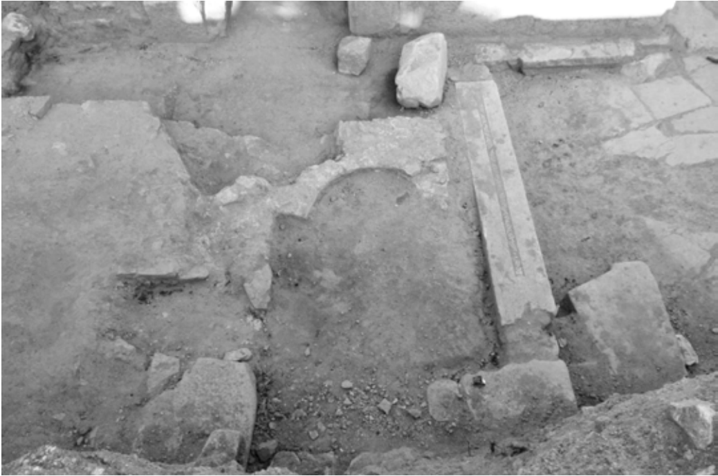
Fig. 2. View of apses in church I Nicaea (Melda Ermiş, İznik ve çevresi Bizans devri mimari faaliyetinin değerlendirilmesi- Evaluation of architectural activities in an around İznik during Byzantine era, Ph. D. Dissertation. Istanbul University, 2009, ill. 114, p. 189)