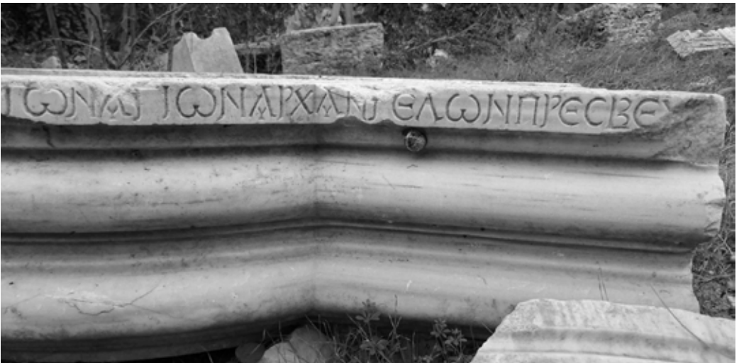
Fig. 8. Inscription carved on the ambo of Church IV Prusa ad Olympum.