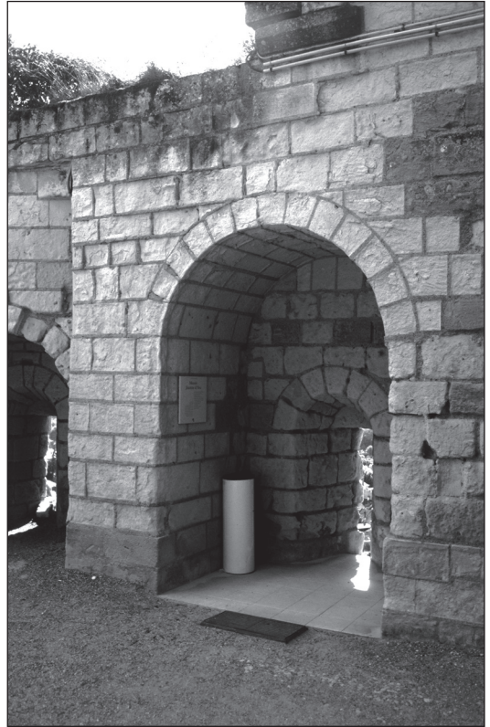
Fig. 4. Embrasure in the east curtain of Chateau de Chinon, Chinon, Indre-et-Loire, France.

Embrasures similar in size and form to those at the Angevin fortress of Chinon survive in Poitou at Le Coudray-Salbart (Curnow 1979, 58). The present castle was built in about 1200 or in the early years of the thirteenth century and it illustrates a turning-point between the experimental castle designs of the late twelfth century and the mature plan of the thirteenth century, of which the inner ward at Pevensey is but one example of many in western Europe. At Le Coudray-Salbart we see a