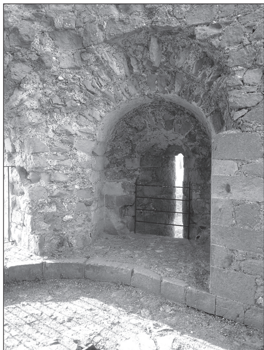
Fig. 3. The ground-floor north embrasure in the northern tower of the gatehouse.

of caution, the putlog holes cut into the ashlar of the mid-eleventh-century church at Jumièges Abbey, Normandy, appear to be contemporary, perhaps necessary due to the great height of the building. However, there is controversy over the construction of the church and the apparent cut-putlog method of construction is not obvious at the next major church in the duchy, St-Etienne at Caen (Taralon 1979, 33–7). More distant still for comparison, the Pisan Romanesque churches on Corsica often show putlog holes as cut features in ashlar facing and they are clearly an integral part of the original build. Whatever the time and place, the character of putlog holes must be always be seen in the context of each particular structure.