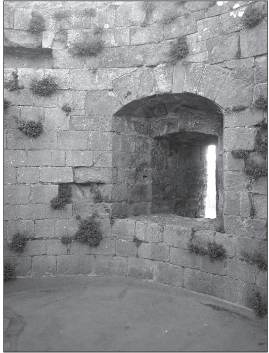
Fig. 5. Embrasure in the first floor of the North Tower.

The significance of the surviving external putlog holes in the northern tower of the gatehouse is now evident: if they relate to secondary works, then the second floor at least is an addition or reconstruction. This restoration is reinforced by the bonding of the upper storey with the west curtain, which in turn links it to the North and East towers and the peculiar embrasures therein. But from this sequence comes the problem of the time difference between the lower gatehouse and the curtains and towers of the inner ward, a problem that possibly led Peers to date the gatehouse as late as possible while acknowledging that the records show it 'was a good deal altered in the latter part of the thirteenth century' and also 'in succeeding years' (1933a, 9; 1933b, 6). Thus the 'great bridge in front of the castle gate was mended' in 1284 and work on the gate itself was ongoing in 1288–91 (Salzman 1906, 8, 9–13). It is difficult to quantify the scale