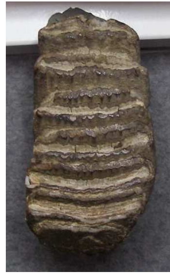
Plate 2 The Belait molar (M 10237) occlusal view.