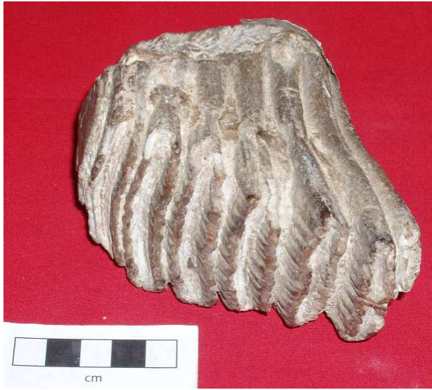
Plate 1 The Belait molar (M 10237 ) lateral view.