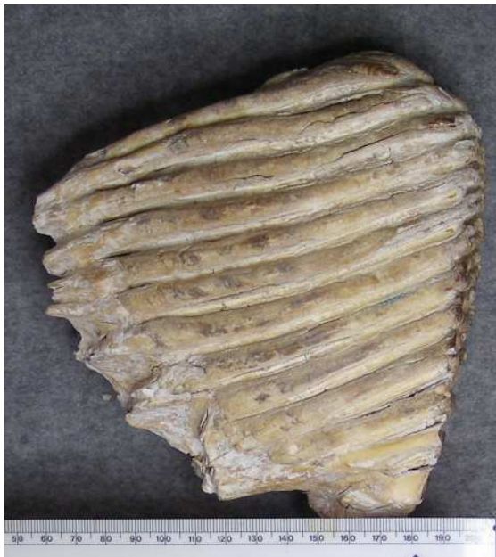
Plate 3 The Niah tooth, lateral view