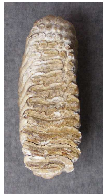
Plate 4 The Niah tooth, occlusal view