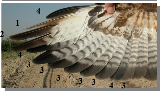
Common Buzzard. 4th year autumn: pattern of primaries (1 juvenile feather; 2 feathers of 2nd year; 3 feathers of 3rd year; 4 feathers of 4th year) (11-IX).