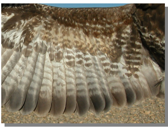
Common Buzzard. Adult: pattern of secondaries (02-XII).