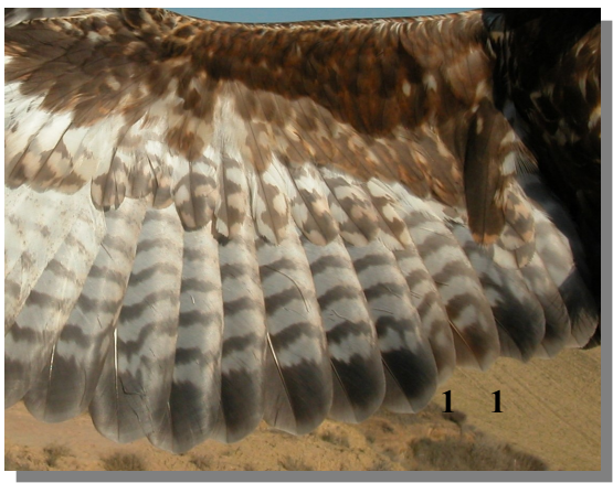
Common Buzzard. 3rd year spring: pattern of secondaries (1 juvenile feathers) (09-II).