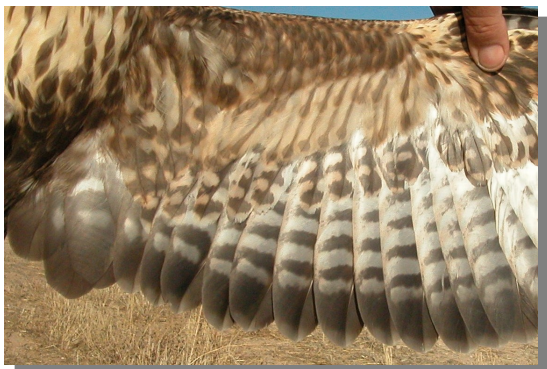
Common Buzzard. Juvenile: pattern of secondaries (29-XII).