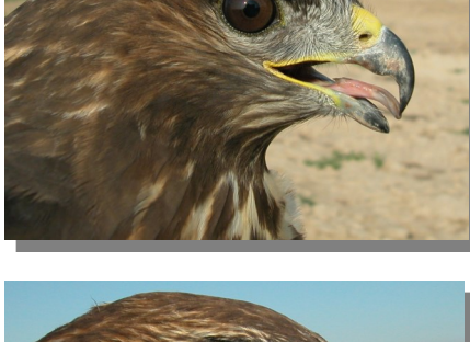
Common Buzzard. Head pattern iris colour. From top to bottom: adult (02-XII); 4th year autumn (11-IX); year spring (09-II); 2nd eyar autumn (26-X); juvenile (25-VIII).