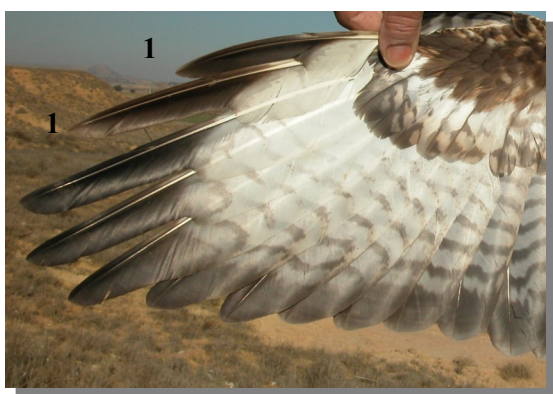
Common Buzzard. 3rd year spring: pattern of primaries (1 juvenile feathers) (09-II).