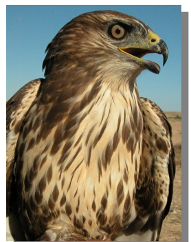
Common Buzzard. Breast pattern: top left 3rd year spring (09-II); top right 2nd year autumn (26-X); left juvenile (25-VIII).