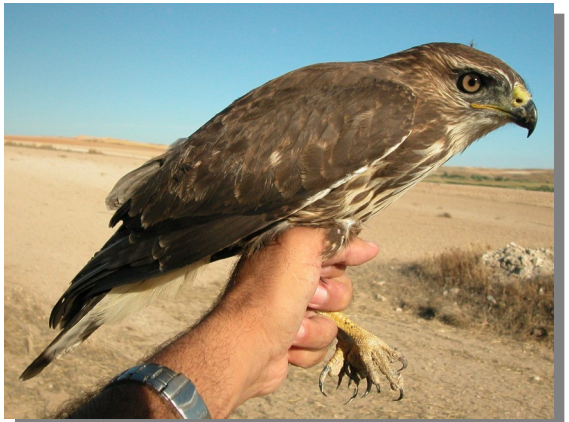
Common Buzzard. Juvenile (25-VIII)