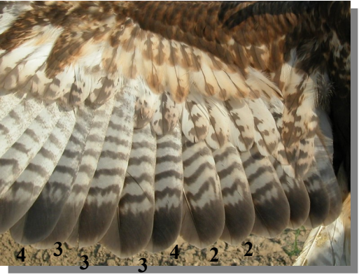
Common Buz- zard. 4th year autumn: pattern of secondaries (2 feathers of 2nd year; 3 feathers of 3rd year; 4 feathers of 4th year) (11-IX).