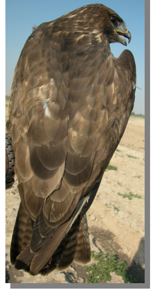
Common Buzzard. Upperpart pattern: left adult (02-XII); right 4th year autumn (11-IX).