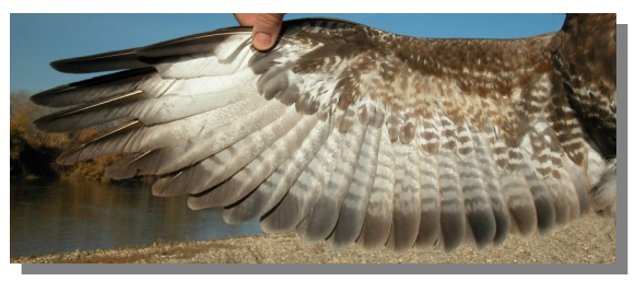
Common Buzzard. Adult: pattern of wing (02-XII).