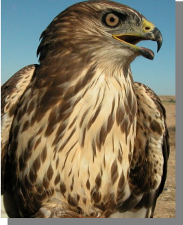
Common Buzzard. Ageing. Pattern of breast: left adult; right juvenile.