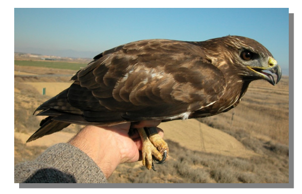
Common Buzzard. 3rd year spring (09-II)