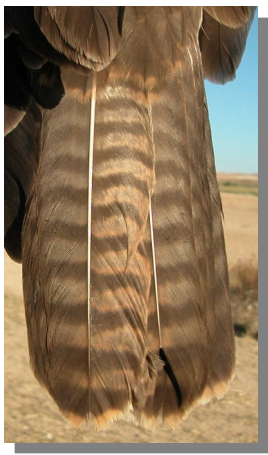
Common Buzzard. Tail pattern: top left 3rd year spring (09-II); top right 2nd year autumn (26-X); left juvenile (25-VIII).