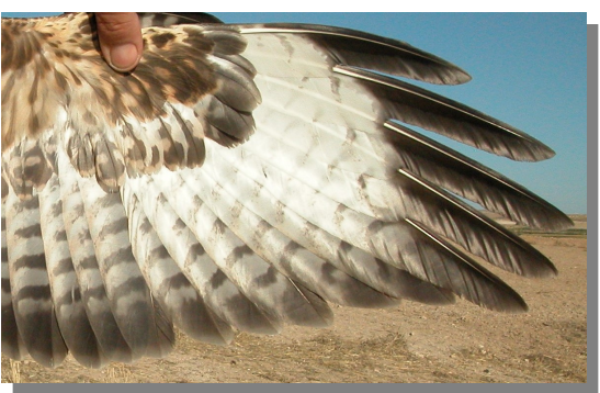
Common Buzzard. Juvenile: pattern of primaries (29 -XII).