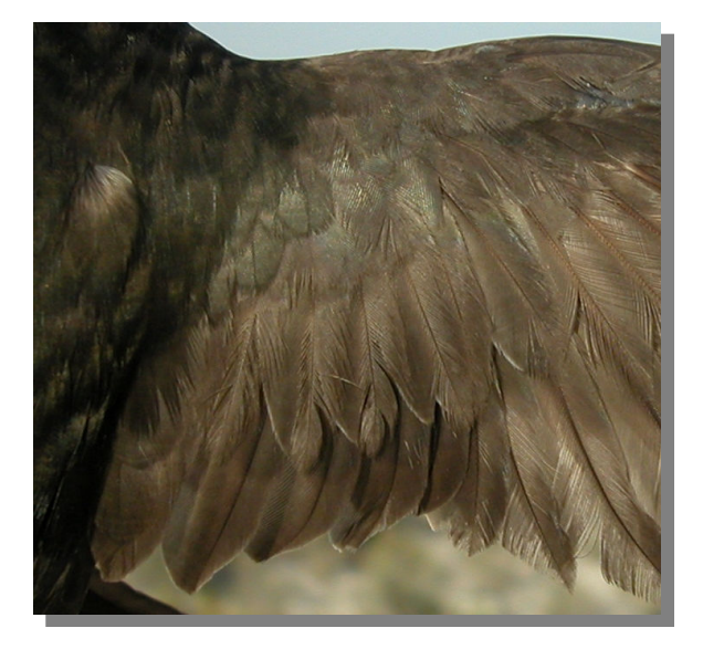
Common Swift. 2nd year: pattern of secondaries and wing coverts (13-VII)