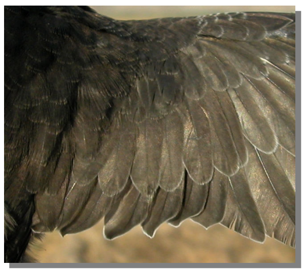
Common Swift. Juvenile: pattern of secondaries and wing coverts (10-VII)