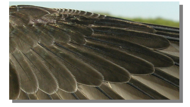
Common Swift. Juvenile: pattern of primary coverts (10-VII)