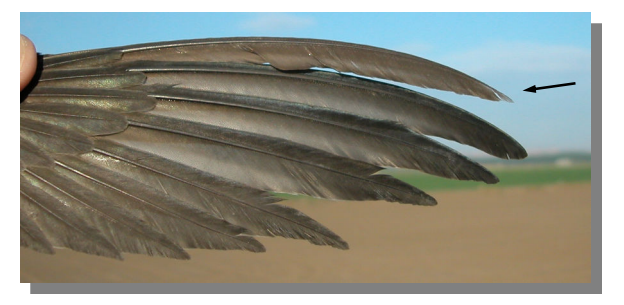
Common Swift. Adult with 10th primary retained: pattern of primaries (02-V)