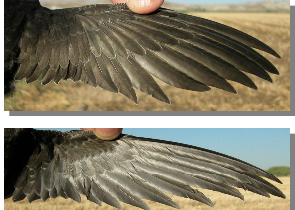
Common Swift. Juvenile: pattern of wing (10-VII)