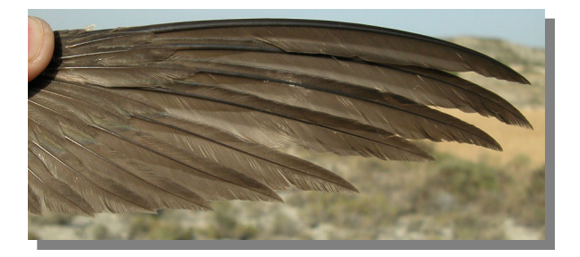
Common Swift. 2nd year: pattern of primaries (13-VII)

Common Swift. 3rd year: pattern of primaries (01-VII)