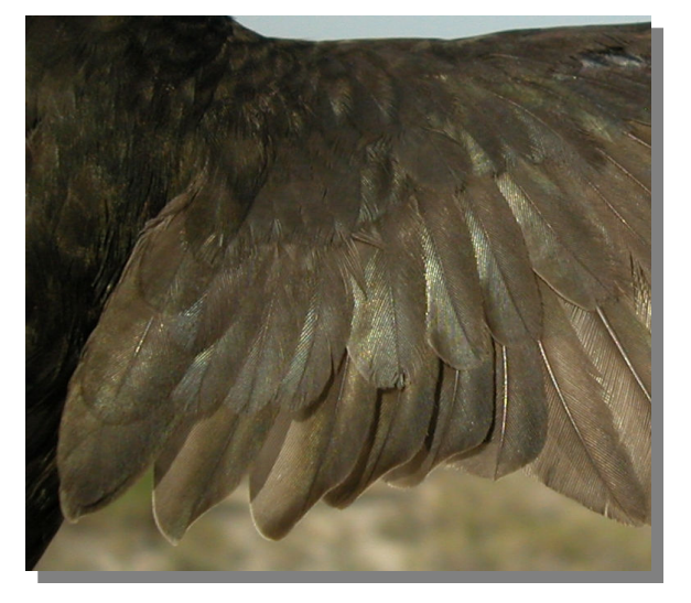
Common Swift. Adult: pattern of secondaries and wing coverts (13-VII)