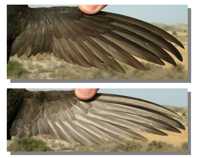
Common Swift. Adult: pattern of wing (13-VII)

Common Swift. Juvenile: pattern of primaries (10-VII)