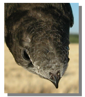
Common Swift. Crown pattern: top left adult (13-VII); top right 2nd year (13-VII); left juvenile (10-VII)