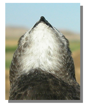
Common Swift. Throat pattern: top left adult (13-VII); top right 2nd year (13-VII); left juvenile (10-VII)