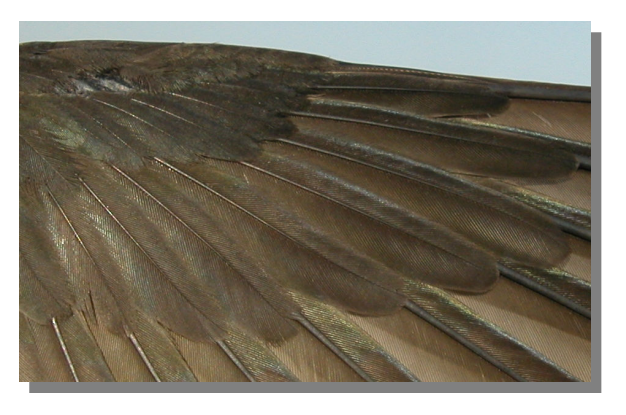
Common Swift. Adult: pattern of primary coverts (13-VII)

Common Swift. Adult: pattern of tail and the outermost tail feather (13-VII)