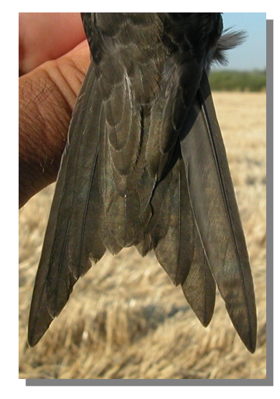
Common Swift. Juvenile: pattern of tail and the outermost tail feather (10-VII)