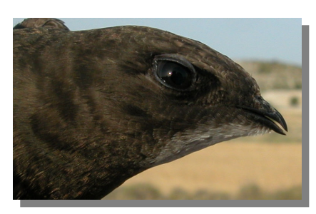
Common Swift. Head pattern: top adult (13-VII); middle 2nd year (13 -VII); bottom juvenile (10-VII)