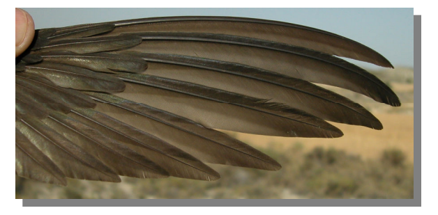
Common Swift. Adult: pattern of primaries (13-VII)