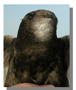
Common Swift. Breast pattern: top left adult (13-VII); top right 2nd year (13-VII); left juvenile (10-VII)