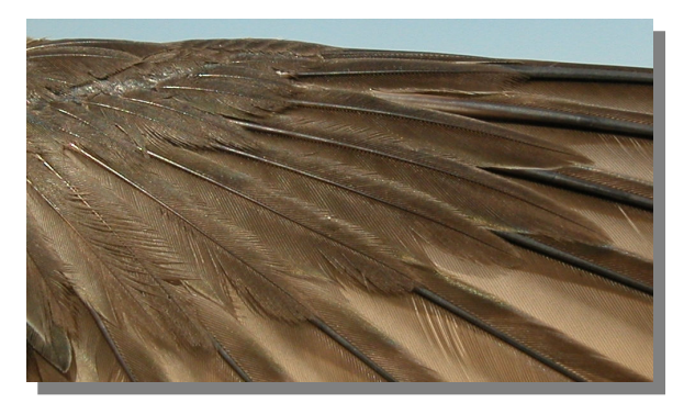
Common Swift. 2nd year: pattern of primary coverts (01-VII)

Common Swift. 2nd year: pattern of tail and the outermost tail feather (01-VII)