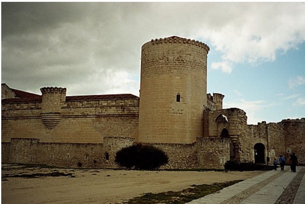
El Castillo Cuéllar ubicado en Castilla y León, España*

La población de Cuéllar, se encuentra entre Segovia y Valladolid, en Castilla y León, España. Según A. de Morales, la genealogía del ilustre linaje de ésta dama se remonta hasta las correrías del Infante don Pelayo en la conquista del Reino de Andalucía.