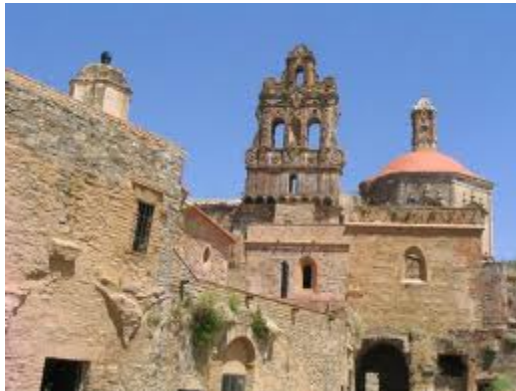
Iglesia de Nuestra Señora de la Consolación - Siglo XIV Cazalla de la Sierra, Andalucía, España