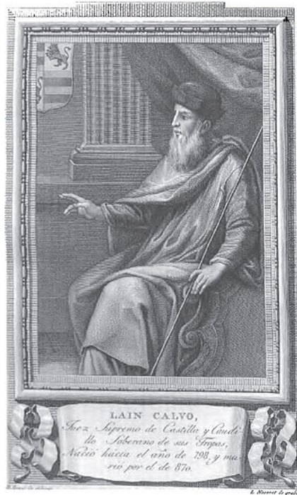
El Conde Laín Calvo Juez Supremo de Castilla (ca. 798 – 870)

Como en muchísimos otros casos, miembros de esta noble familia pasaron a América y aquí nos concentramos en la descendencia que se originó primero en el Virreinato del Perú y luego en la Audiencia de Charcas, o sea la actual ciudad de Sucre, Departamento de Chuquisaca, Bolivia, llamada por entonces la ciudad de La Plata por la cantidad de este metal extraído del Cerro Rico de Potosí que era comercializada en dicha Audiencia de Charcas.