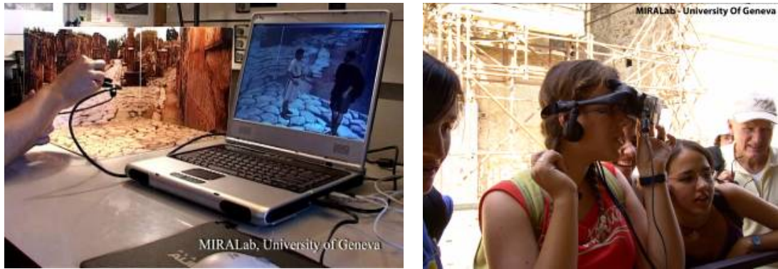
Figure 3 Example of a mobile AR system based on a laptop, backpack, and video see-through HMD