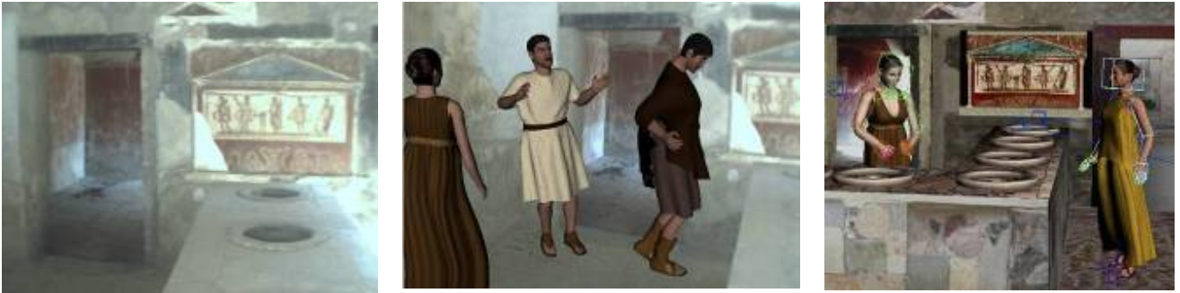
Figure 2 Examples of Real, AR and VR environments from a mobile AR system (images courtesy of Papagiannakis et al [12])