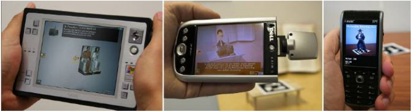
Figure 4 Examples of handheld mobile AR devices : UMPC, PDA and SmartPhone