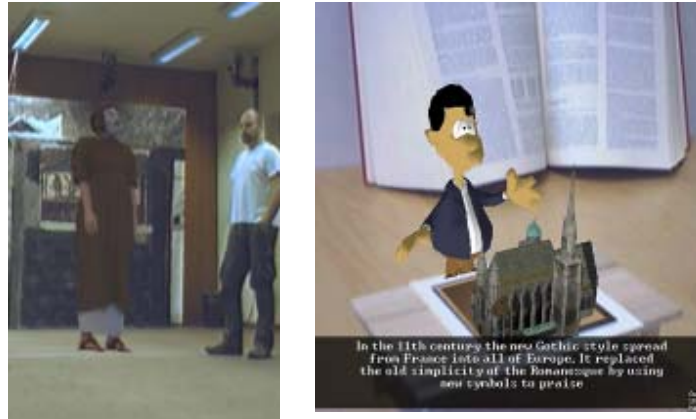
Figure 5 Real-time Virtual Characters in AR