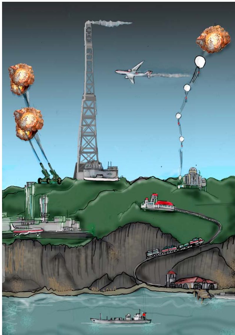
Figure 1. Proposed methods of stratospheric aerosol injection. A mountain top location would require less energy for lofting to stratosphere. Drawing by Brian West.

of smaller ones? These important topics are currently being investigated by us, and here we limit the discussion to just getting the precursor gases into the stratosphere.