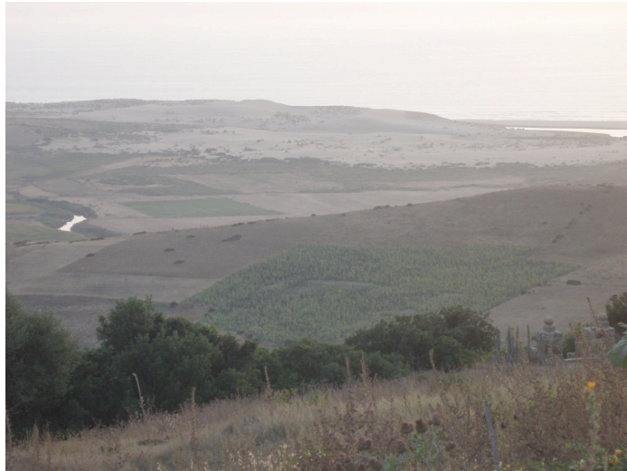
Figure 4 - Stunning coastal scenery with intact sand dune south of Asilah, Morocco.

Many mining sites on the coast of Morocco are remote, but fabulously beautiful (Figure 4). While maintaining a healthy ecosystem, hotel complexes could readily be constructed within the still-extensive coastal sand dunes of Morocco