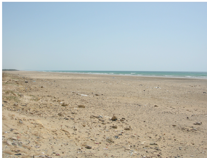
Figure 7 – Beach reduced to gravel at Hawara, Morocco.

The rocky layers that once were buried in sand replace dunes. The dune ecosystem is completely gone. Back-dune vegetation is dying because it is no longer protected from salt spray and wind by dunes. Wetlands are at risk because of sand and salt intrusion. The coastal road to Tangier will occasionally be flooded and perhaps even eroded in places in future storms due to the lack of protective dunes. The beach will not experience normal storm recovery because of the lack of dune sand and erosion (shoreline retreat) rates can be expected to increase significantly in future years. Present and future buildings constructed to get a sea view will be endangered in future storms.