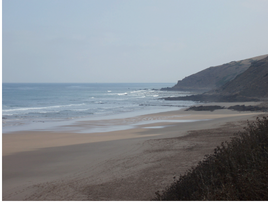
Figure 1 - sea cliff erosion in Morocco.