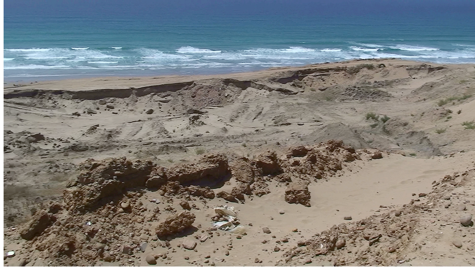
Figure 8 - Lunar landscape left from sand mining operations south of Asilah, Morocco.

In this undeveloped area no buildings or infrastructure are threatened. A beautiful potential touristic development site is completely eliminated and because of the ugliness of the mined site adjacent to the beach and the “attractive nuisance” hazard to hikers. It is fair to say that no future tourism site is feasible as such for miles in either direction. The loss of overall sand volumes at this site is likely to increase overall shoreline retreat rates on adjacent shorelines in both directions.