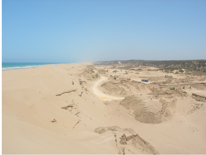
Figure 9 - The large vegetated “fossil” dune on the right is an alternative to mining the active dune on the left. Located near Kenitra, Morocco.

If mining continues on some limited basis, reclamation (reshaping) of the impacted landscapes must be required. In some areas reclamation of existing, abandoned mining sites should be considered.