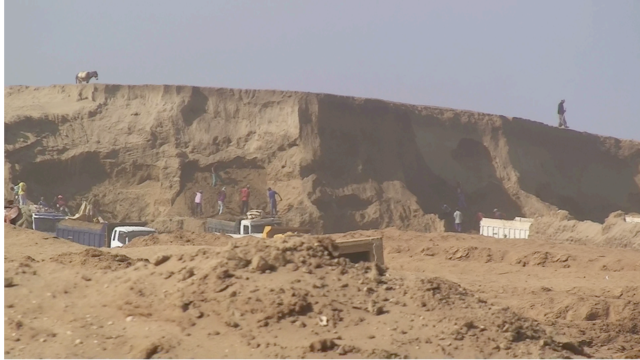
Figure 5 - Bluff top sand mining south of Larache, Morocco.

The sand being removed here, in spite of its location well above the local beach and dune, may still be a part of the active coastal sand system. That is, the sand here may still occasionally supply new sand to the beach in processes such as storm recovery. More important, however, is the loss of a beautiful and rare dune system with a rare ecosystem adjusted to much wind and salt spray. The lost dune would have been an asset for a future touristic development because of its safe location with commanding views high above the sea. In addition, these areas represent potential archaeological sites. They should be surveyed before they are mined. National treasures are at risk. Nevertheless, mining these perched dunes is less destructive to the coastal ecosystem than the mining listed below.