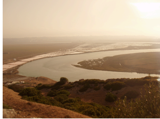
Figure 2 - Loukos River, Larache, Morocco.

The sand grains travel along a particular beach either by shore-parallel or shore-perpendicular transport in surf zone currents formed by waves. Speaking in general terms, the Moroccan coast has a very large coastal sand body resupplied by regular erosion of cliffs and episodic injections from rivers in flood. The Moroccan coastal sand body is much larger than the coastal sand bodies of the East and Gulf coasts of North America. We can only assume that those engaged in sand mining in Morocco believe that they will do little harm because the original sand deposits were so large. Sadly, this is not the case.