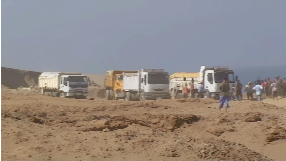
Figure 3 - Sand trucks at a mine south of Larache, Morocco.

The problems created by sand mining are numerous. Below is a brief summary focusing on the problems recently documented in Morocco.