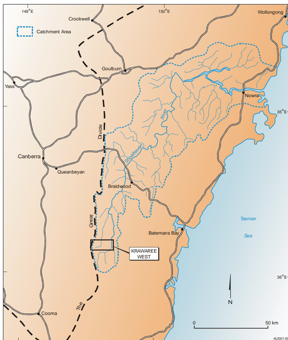
Figure 1. Location of Krawaree West study area (from Lewis, 2000).

The Krawaree West area is defined by the western parts of the Krawaree 1:25,000 topographic sheet. The mapsheet area is named after Krawaree homestead which is approximately 50 km southeast of Canberra (Figure 1).