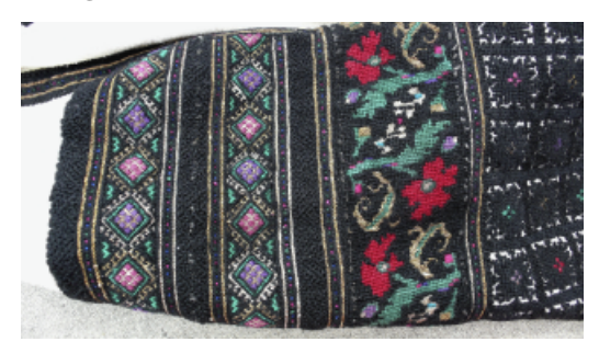
Figure. 3 Ternopil Province, Woman's Blouse (detail), early 20c. embroidery. Chicago, Ukrainian National Museum