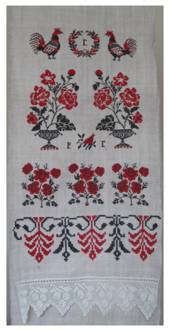
Figure. 1 Kyiv Province, Dobranychivka (attributed origin) Wedding Ritual Cloth , early 20c. embroidery. Private collection of Natalie Kononenko assembled with the help of Halyna Kapas

wide-ranging palette of red, orange, green, black and yellow (Figure 3). The distinction maintained between each individual region serves its purpose as an identity marker for the maker and the keeper of the piece who were typically of the same village, as in the case of a mother gifting a wedding rushnyk she had embroidered to her daughter. The regional pattern identified the familial birthplace and home of origin and,