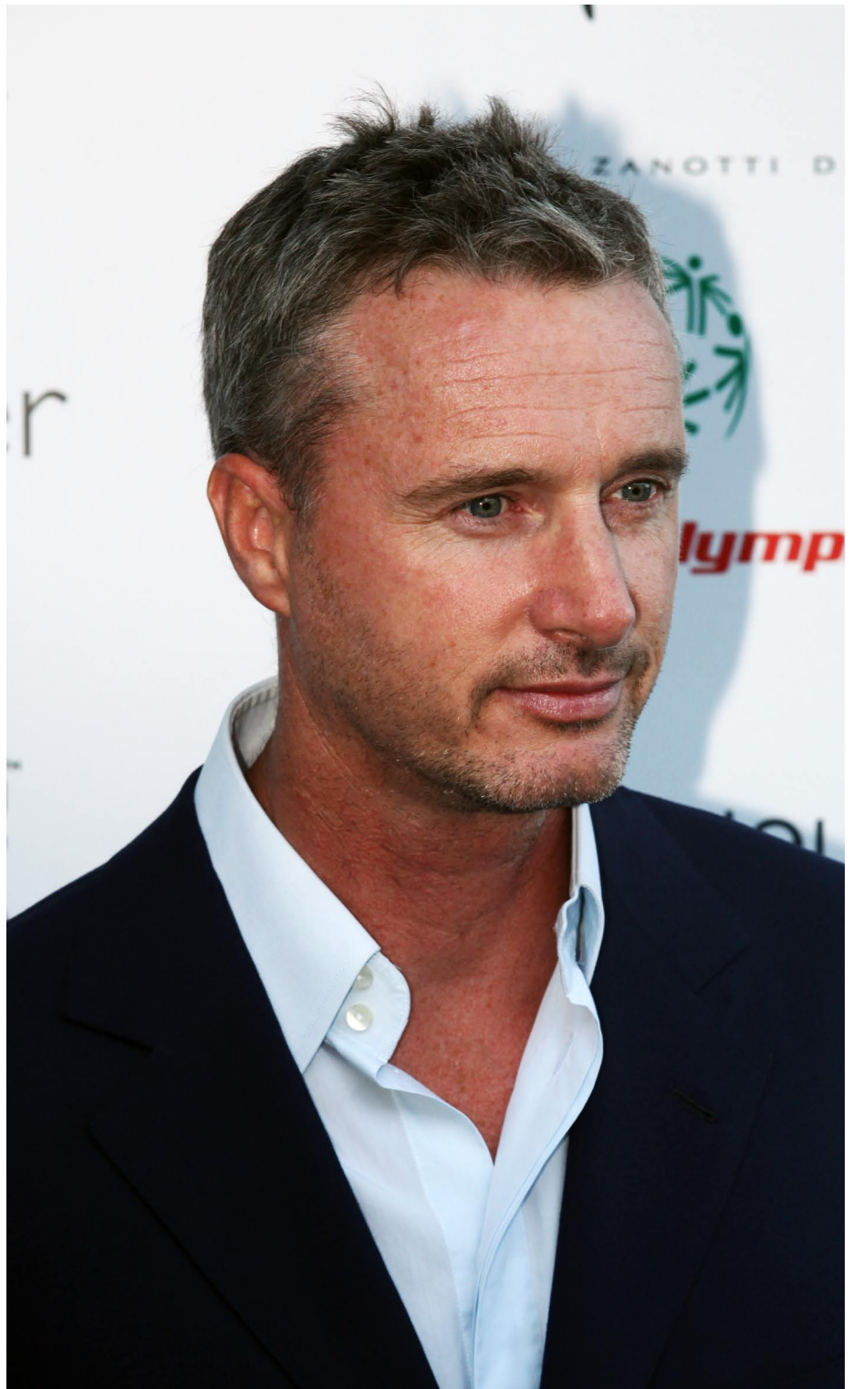
Eddie Irvine reads a letter written by a person on the Titanic in the BBC Radio Ulster series Titanic Letters

Titanic Letters starts on BBC Radio Ulster on Monday, April 9 with three programmes broadcast each day until Sunday, April 22. Monday, April 9 - Friday, April 13 at 8.55am, 11.55am and 4.55pm; Saturday, April 14 at 8.55am, 11.55am and 6.05pm; Sunday, April 15 at 9.45am, 11.55am and 6.05pm; Monday, April 16-Friday, April 20 at 8.55am, 11.55am and 4.55pm; Saturday, April 21 at 8.55am, 11.55am and 6.05pm; and Sunday, April 22 at 8.25pm, 11.55am and 6.05pm. 92-95FM & DAB digital radio, digital TV and online at bbc.co.uk/radioulster