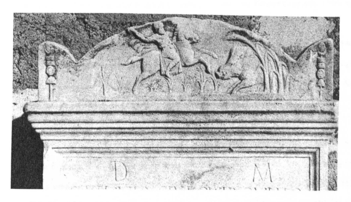
5.1: Sex. Flavius Quietus