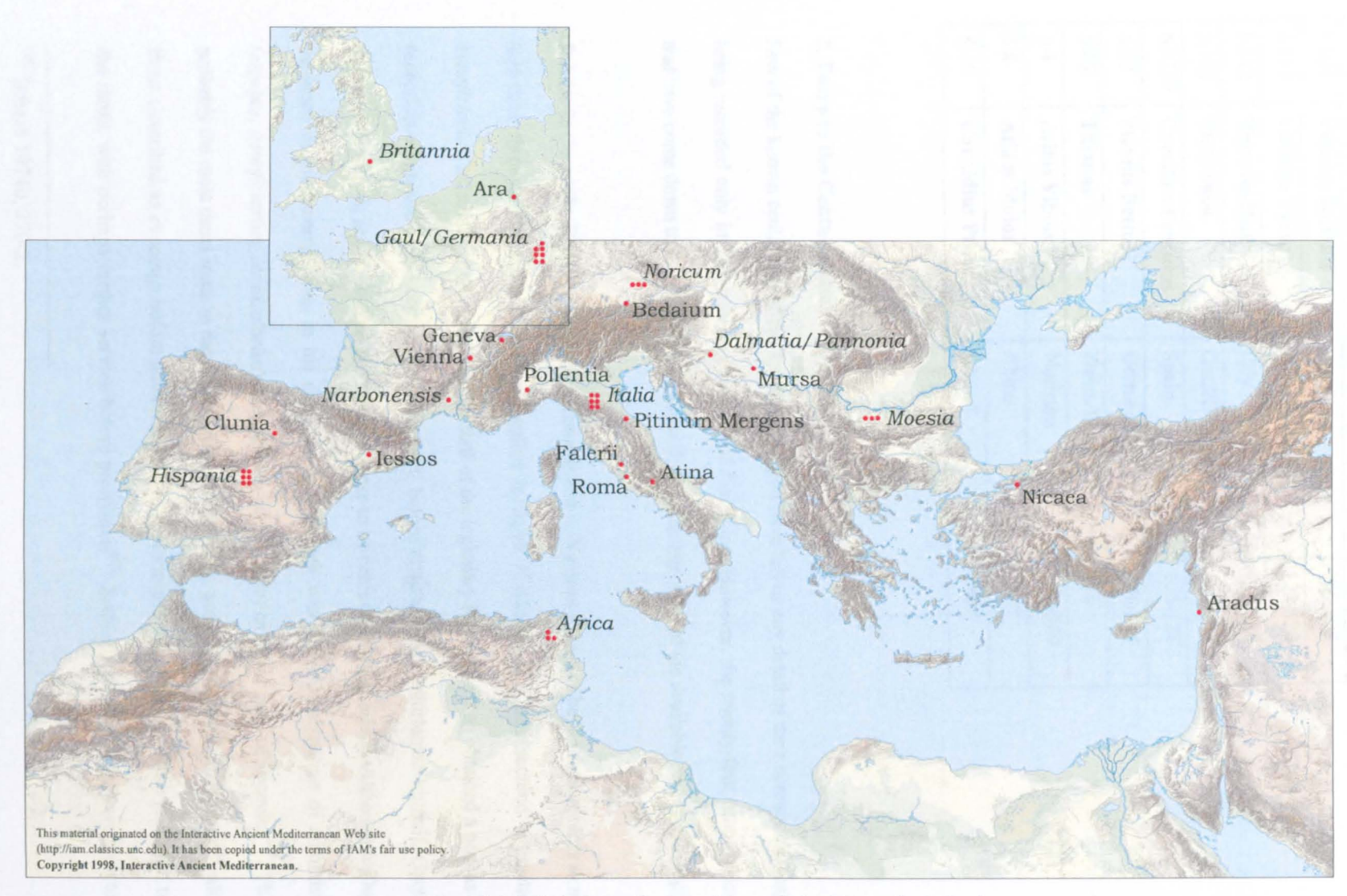
Fig. II.6.1 Origins of centurions of the Twentieth legion