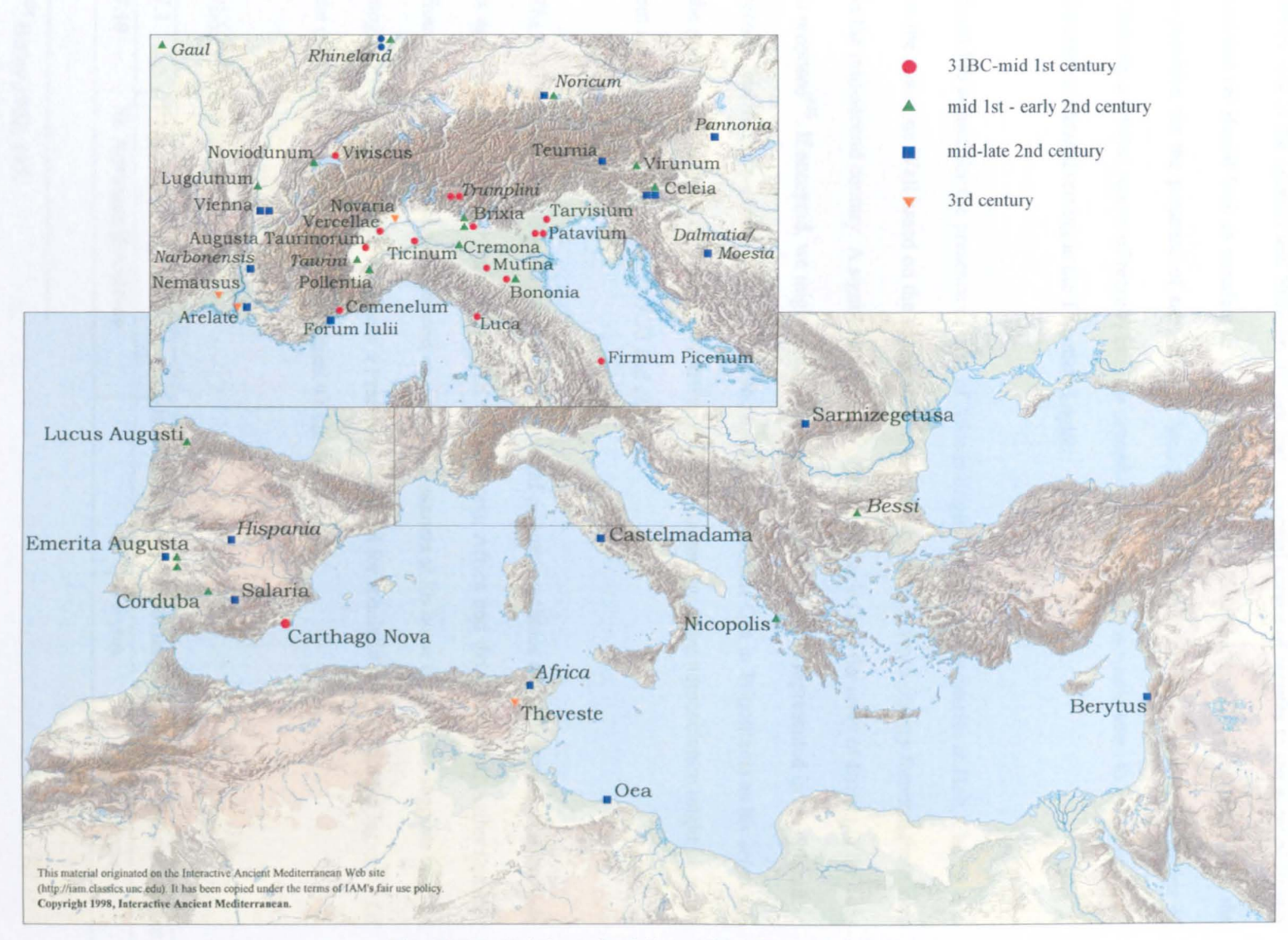
Fig. II.7.1 Origins of soldiers of the Twentieth legion