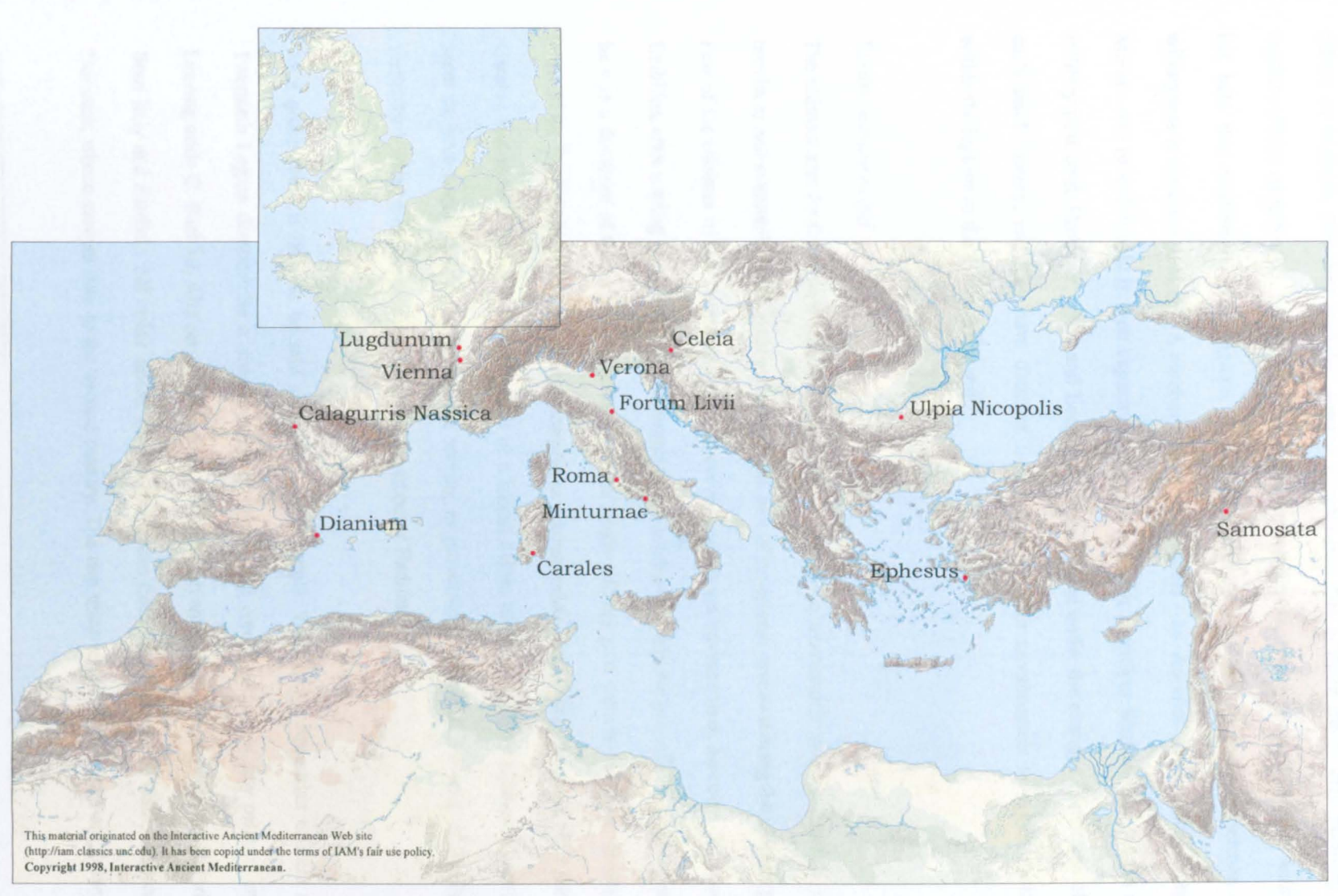
Fig. II.3.1 Origins of equestrian tribunes of the Twentieth legion