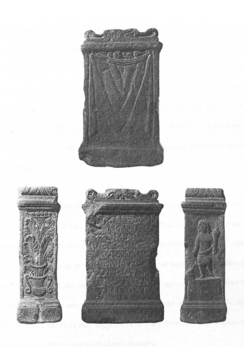
3.8: Flavius Longus