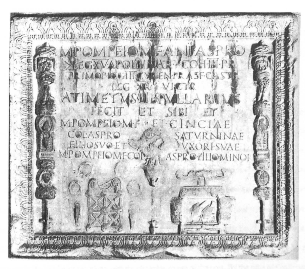
4.2: M. Pompeius Asper