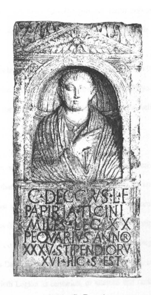
7.30: C. Deccius