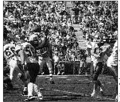
Louisiana Tech's Tim Rattay is Division I-A's total offense leader in career yards per game with 382.4. His 12,618 total yards ranks second behind Ty Detmer of Brigham Young.