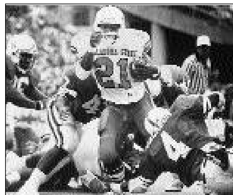
Barry Sanders remains the only Division I-A player to compile over 3,000 all-purpose yards in a season, after totaling 3,250 as an Oklahoma State junior in 1988.