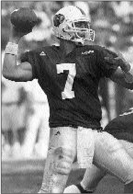
Louisville sports information