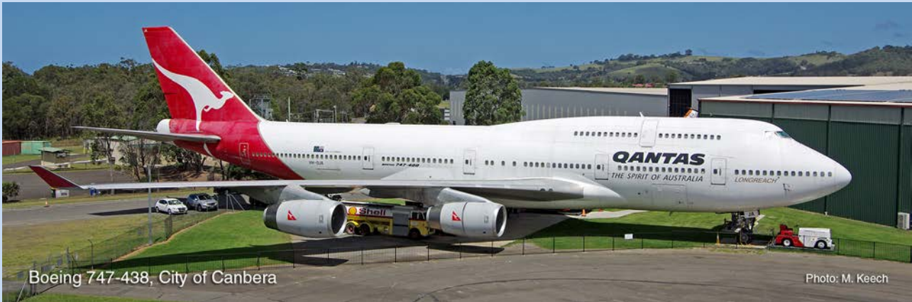
Boeing 747-438, City of Canberra

At HARS our Boeing 747-438, City of Canberra will celebrate the 30th anniversary of its first flight on 3 July this year.