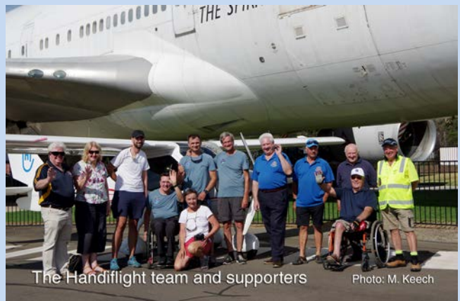
The Handiflight team and supporters