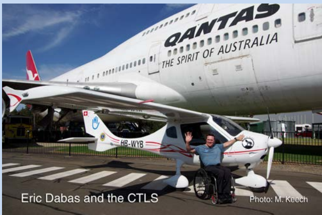
Eric Dabas and the CTLS

The CTLS is a German-produced fibreglass ultralight with a range of up to 1,000 nautical miles. Leaving Switzerland in November 2018, the flight has travelled through Italy, Greece, Egypt, Saudi Arabia, UAE, Pakistan, India, Bangladesh, Thailand, Singapore and Indonesia before arriving in Perth earlier this month. The aircraft has been modified with a hand control for the rudder and brakes so that it can be operated by pilots who are unable to use their legs.