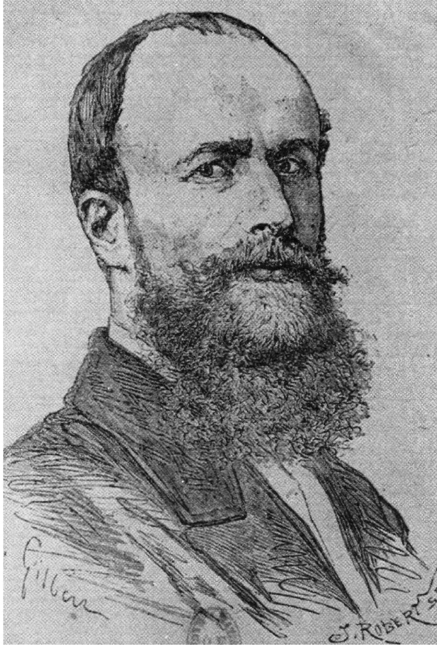
Gustave Flourens in 1866, in an engraving by James Robertson.