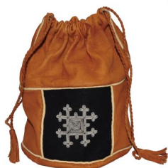
Reindeer Leather Bag (Sami)