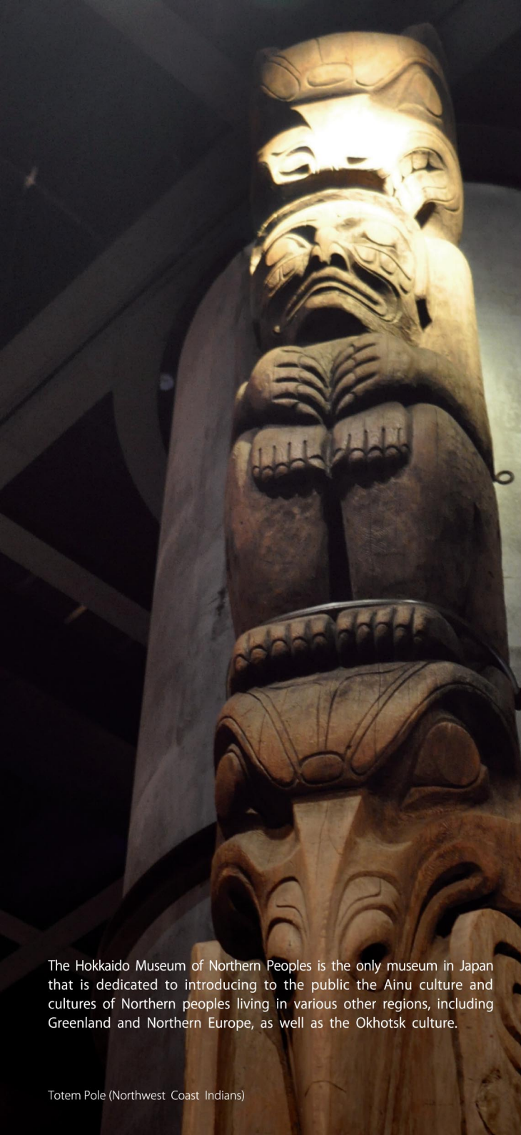
The Hokkaido Museum of Northern Peoples is the only museum in Japan that is dedicated to introducing to the public the Ainu culture and cultures of Northern peoples living in various other regions, including Greenland and Northern Europe, as well as the Okhotsk culture.