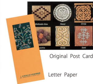
Original Post Card