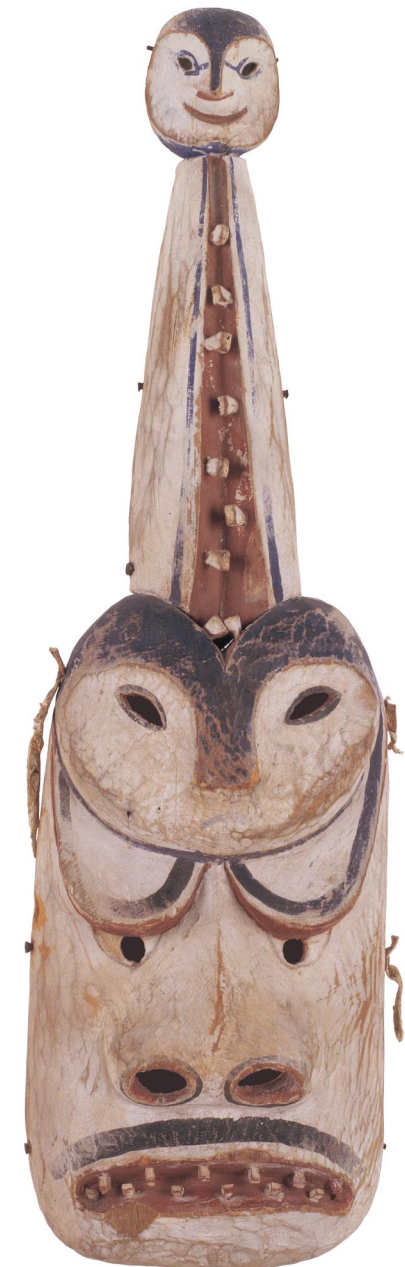
Inua Mask (Eskimo)