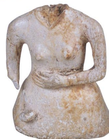
Female Figure (Moyoro Shell Mound)