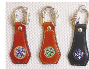
Beaded Key Holder (Koryak)