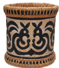
Birchbark Box (Nanai)

Exhibits consist mainly of objects that Northern peoples used in the period from the late 19th century through the early 20th century. They include restored objects and contemporary crafts. The wealth of audio and visual materials distinguishes this museum.