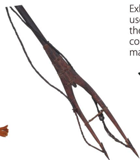
Toggling Harpoon (Hokkaido Ainu)