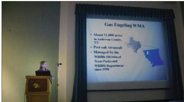
Ashley Tubbs delivers a talk on the effects of fire on the east Texas herpetofauna.