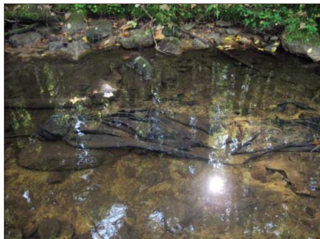
Figure 3. Relocation of the black plastic sheeting in Laurel Fork Creek at the same location two years after its initial discovery in September 2013.