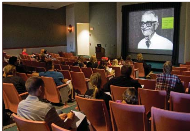
Interested attendees took part in a quiz of Kansas herps and herpers Saturday afternoon.