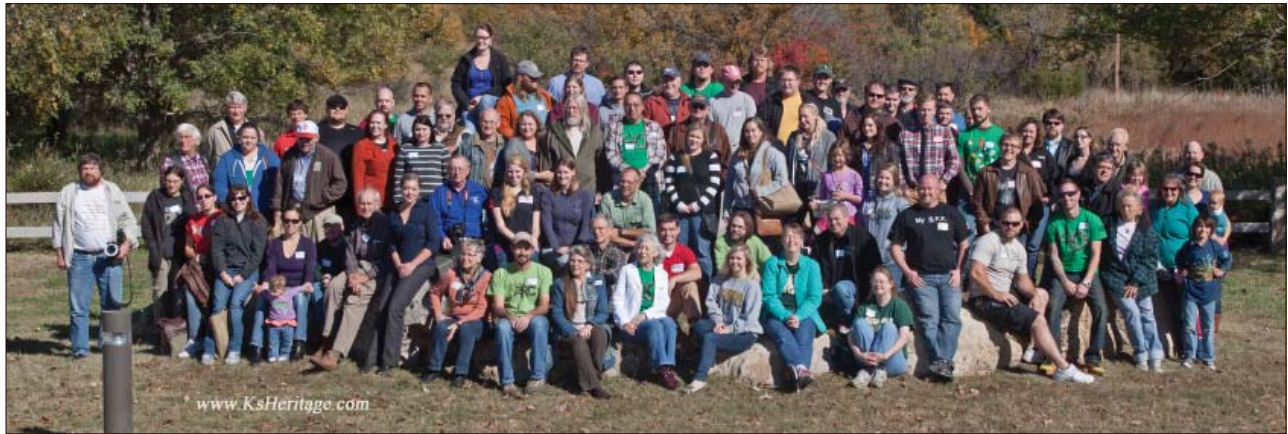
Group photograph of the attendees of the 40th Annual KHS Meeting assembled outside the Great Plains Nature Center.