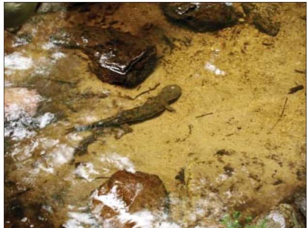
Figure 2. The Cryptobranchus alleganiensis alleganiensis individual making its way upstream to the piece of plastic sheeting immediately after its release.