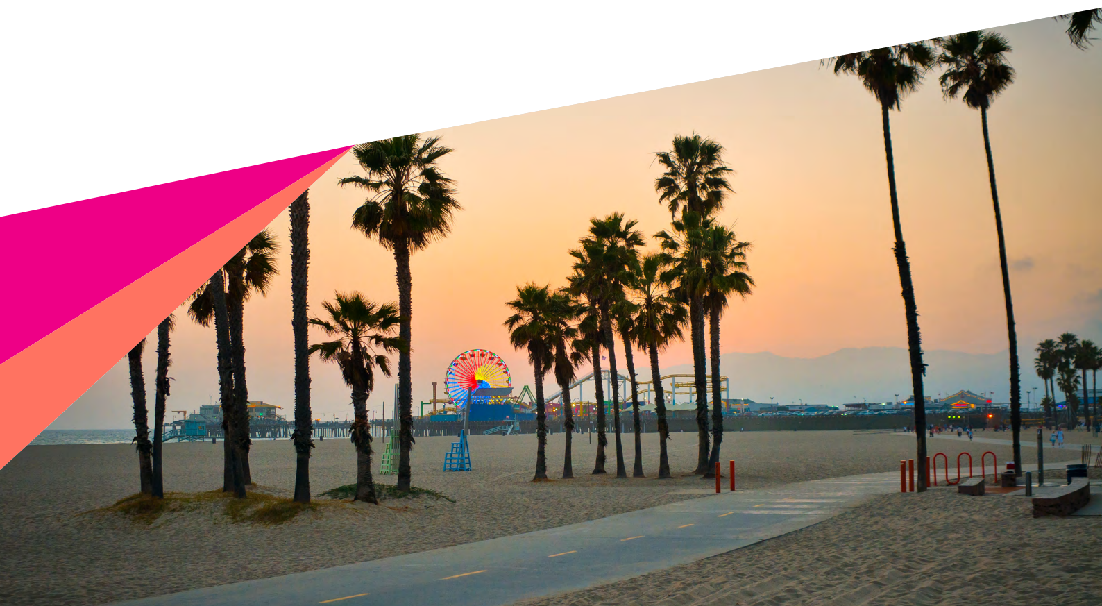
IMAGE CREDITS: Table of Contents: © Gary Weathers/Getty Images; I: © AECOM; III: © AECOM; IV(B): © HKS Architects; p.1: © Nigel Killeen/Getty Images; p.5: © 2012 Comite International Olympique (CIO) Evans, Jason; p.8: © Scott Stulberg/Getty Images; p.9: © Max Bailen/Getty Images; p.10: © Long Beach Convention & Visitors Bureau; p.11: © Long Beach Convention & Visitors Bureau