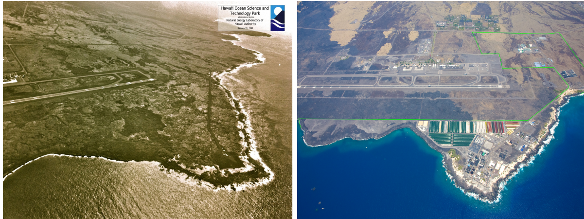
Hawaii Ocean Science and Technology (HOST) Park before and after development

Table 9 can be interpreted for the state as a whole or industry-by-industry. For example, take the transportation industry. NELHA tenants collectively spent $1.1 million in this individual sector. The impact on Hawaii's larger economy from NELHA's spending on the transportation industry was $2.2 million in output (sales), $600,000 in employee earnings, $100,000 in additional state taxes, and 13 additional jobs. The total state impact from all of NELHA's spending was an increase of $87.7 million in output (sales), $24.7 million in earnings, $4.5 million in increased state taxes, and 583 additional jobs.