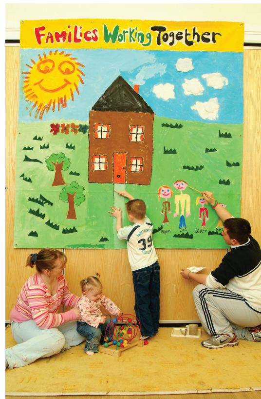
Quarriers Family Resource Centre is working to keep families together in areas of significant disadvantage in Glasgow

Hence a person's life chances are often predicated on their experiences in childhood. A child's ability to engage at school is in part determined by their home life, and their subsequent (un)employment likewise.