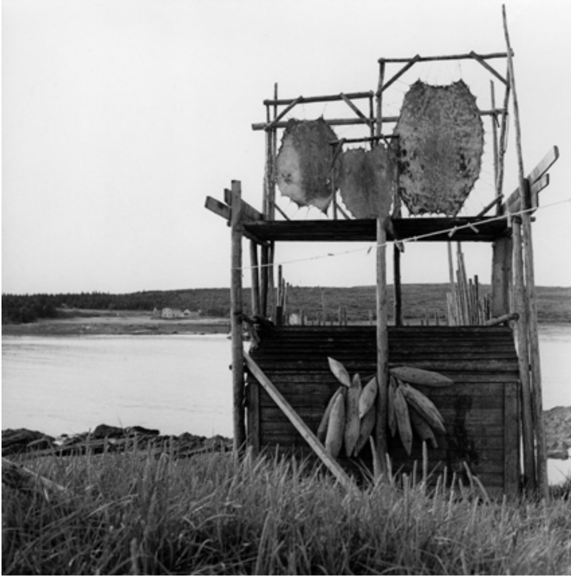
"Wild wheat and Sealskins" Meldgaard named this photo in the diary. He probably saw this as the epitome of the mixed economy that represented the Norse Greenlanders, who had been documented to have subsisted equally on both wild and domesticated resources. The photo was taken from Burnt Island looking across Ha Ha Bay with the green fields of Raleigh in the far back.