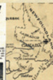
NEWFOUNDLAND CANADA Miramichi St. John's The site where the ruins were found is marked with a cross on the map.

Den norske forfatter Helge Ingstad har fundet et nordbohus i nordenden af Newfoundland. Det