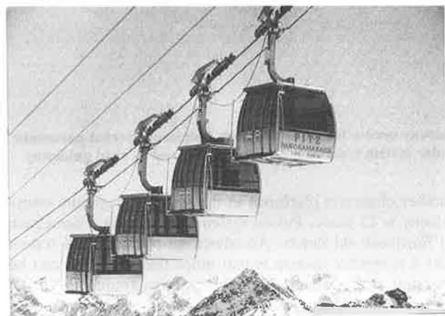
FIGURE 3 Pulsed system.

tinguish between technologies that offer smaller, more “personalized” vehicles from technologies that carry large numbers of people in single vehicles. The upper boundary of 14 passengers for small TUs was chosen to include the Soule SK system in the small vehicle category. The next boundary of 50 passengers per TU was chosen to distinguish between typical capacities for detachable and nondetachable TUs. The