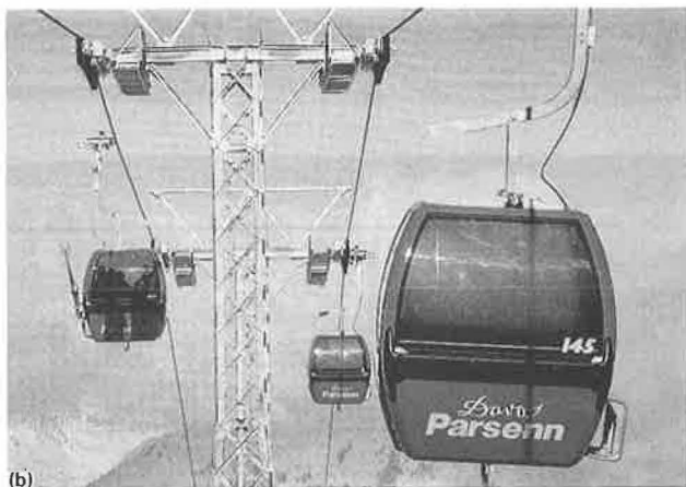
FIGURE 2 Continuous systems: a , bottom-supported system; b , suspended vehicle cable guideway gondola system.