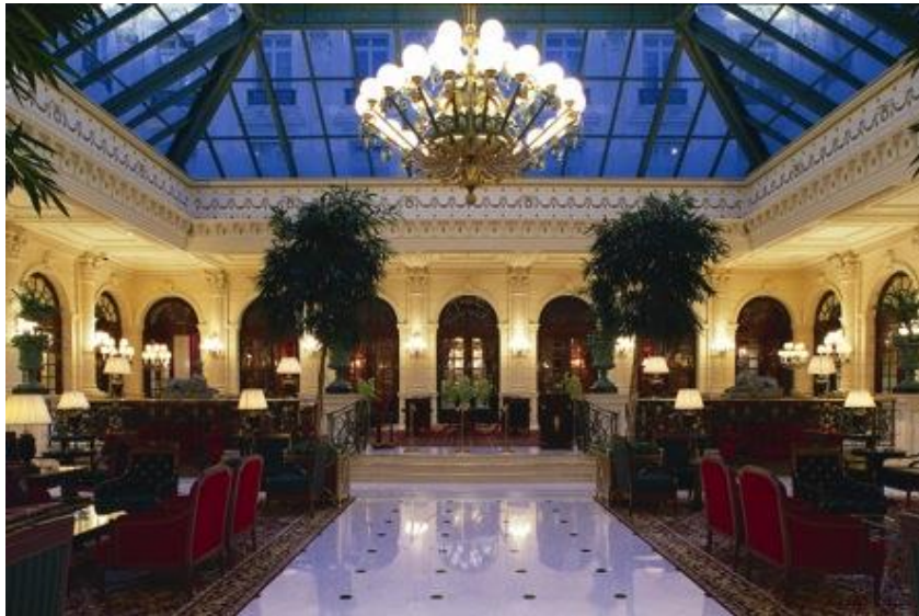
The Grand Hôtel's Atrium

At the InterContinental Paris Le Grand, all roads lead to the atrium La Verrière, a superb 800m 2 winter garden where giant ficus trees grow and white orchids blossom.