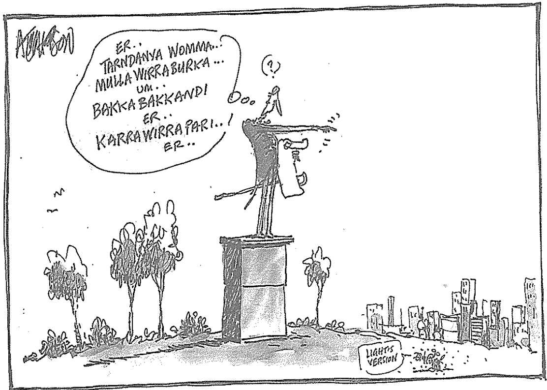
Figure 1: Cartoon from The Advertiser, 16 March 2000