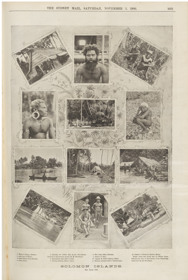
Figure 33. 'Solomon Islands'.