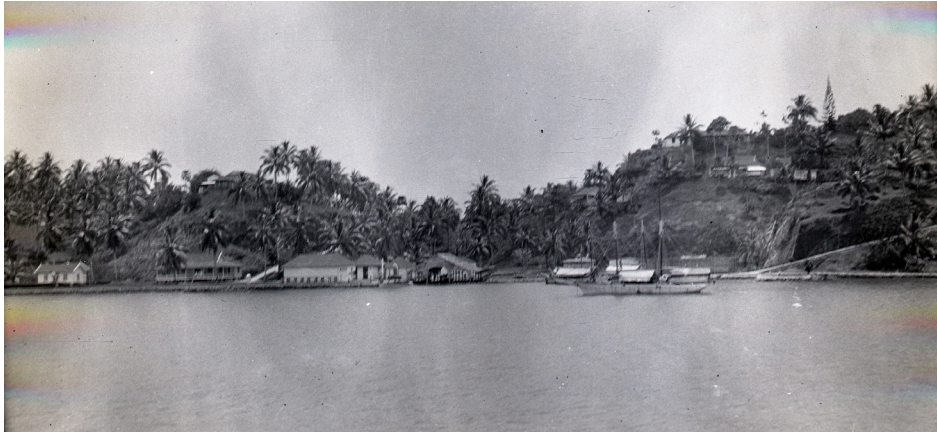
Figure 32. Tulagi waterfront.