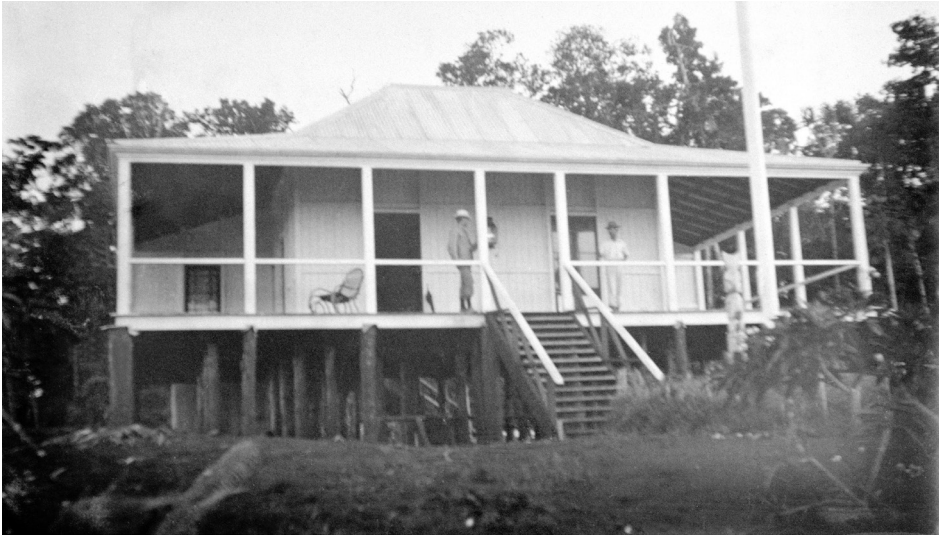
Figure 30. Government Residency, 1909.