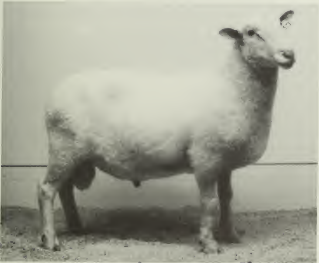
Rideau Arcott ram