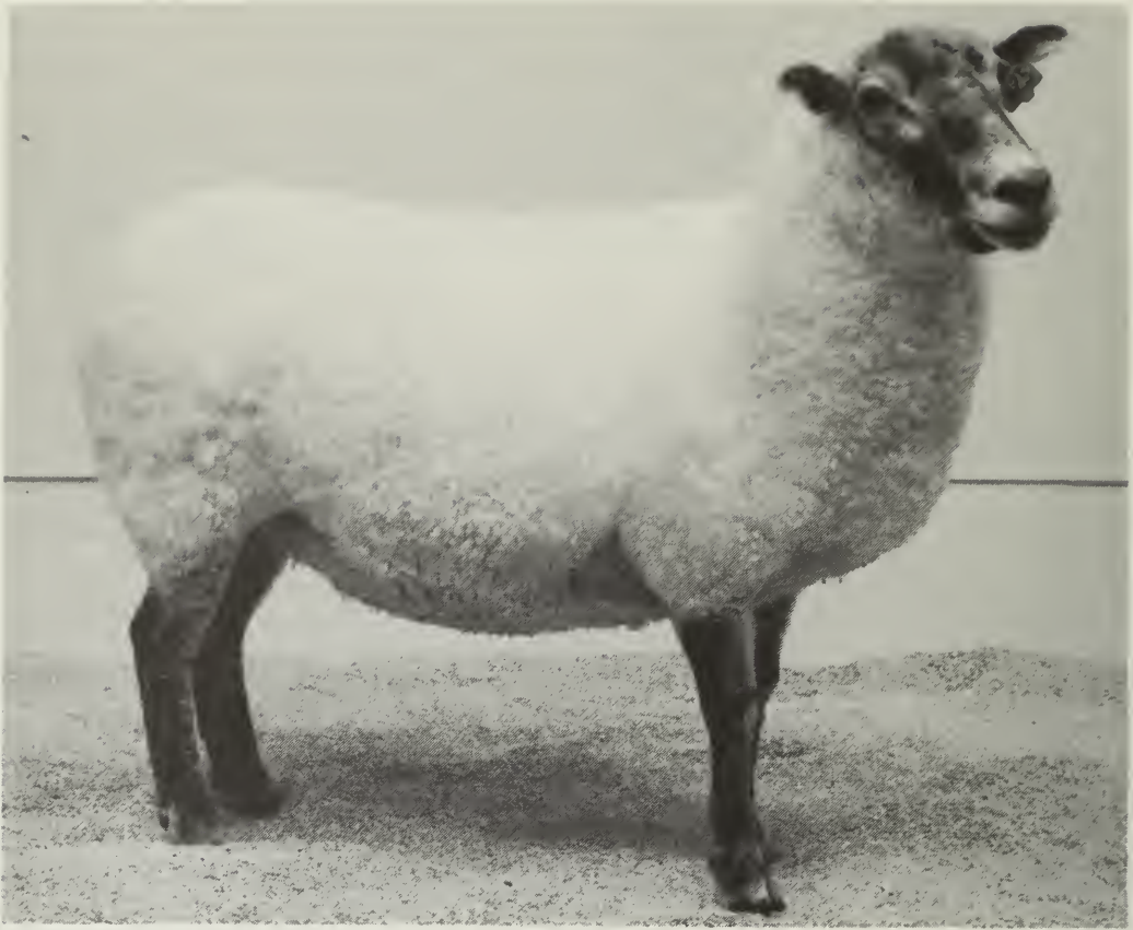
Outaouais Arcott ewe