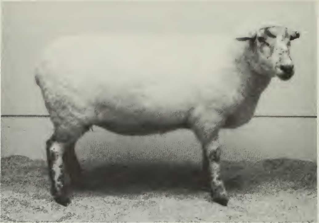
Canadian Arcott ewe