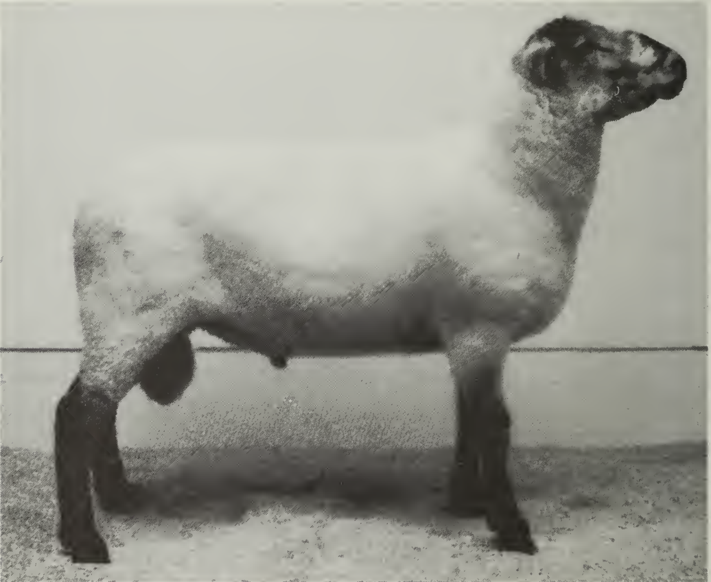
Canadian Arcott ram