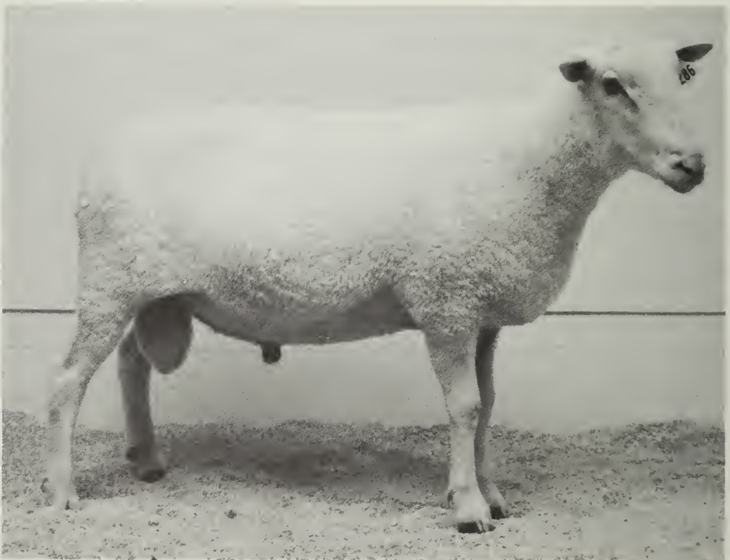
Outaouais Arcott ram