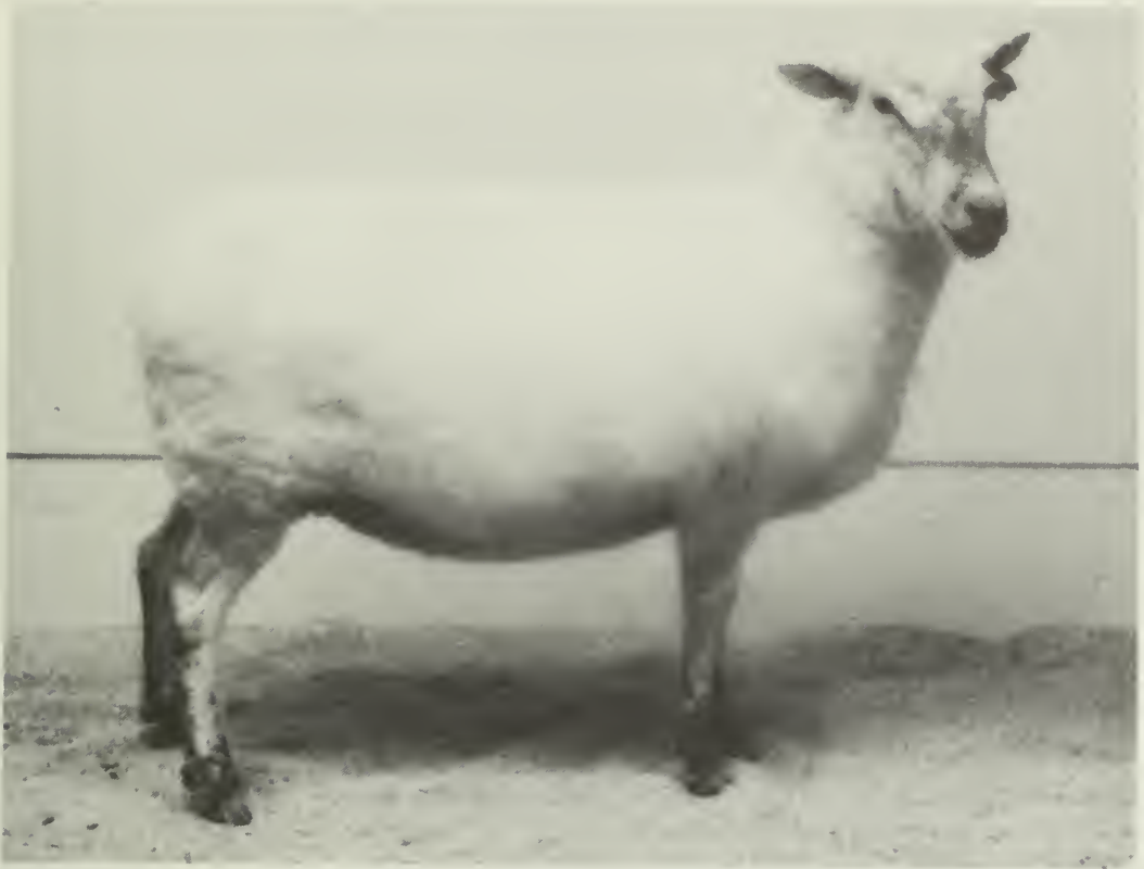
Rideau Arcott ewe