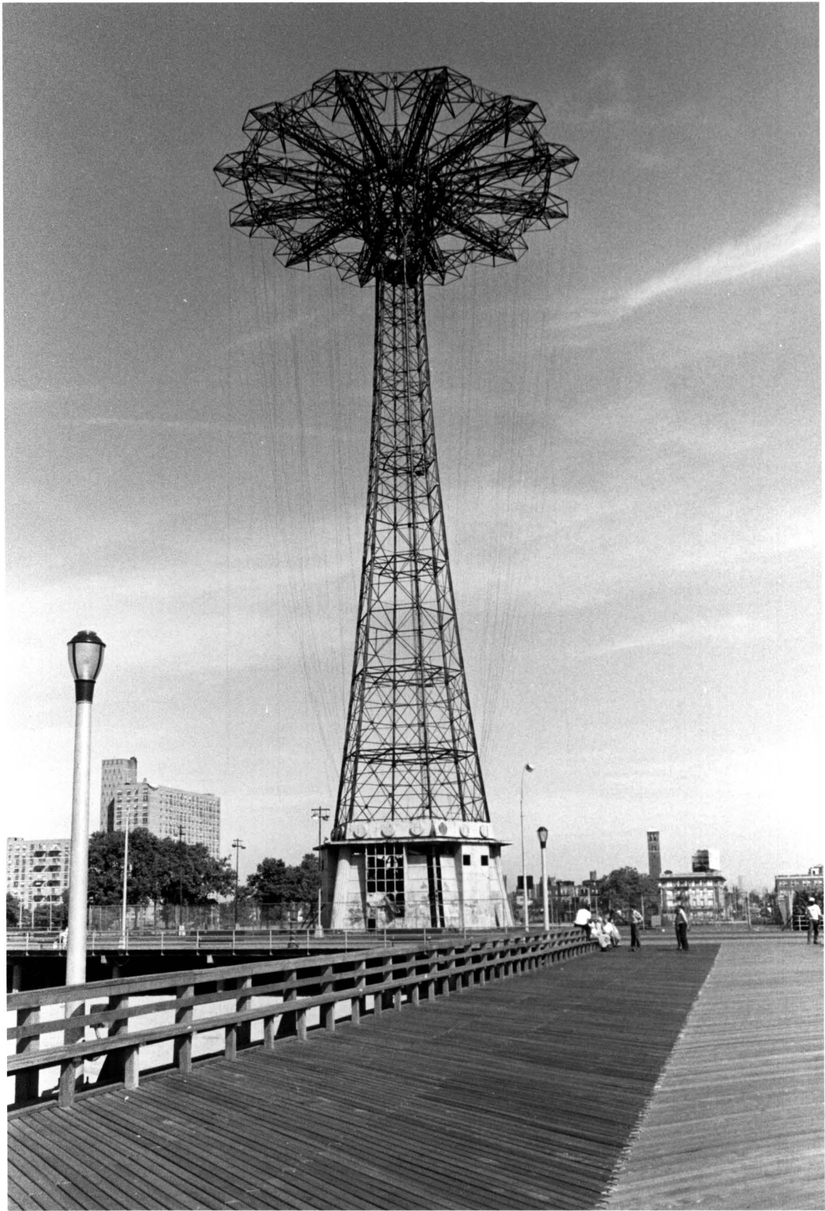
Parachute Jump - view from south