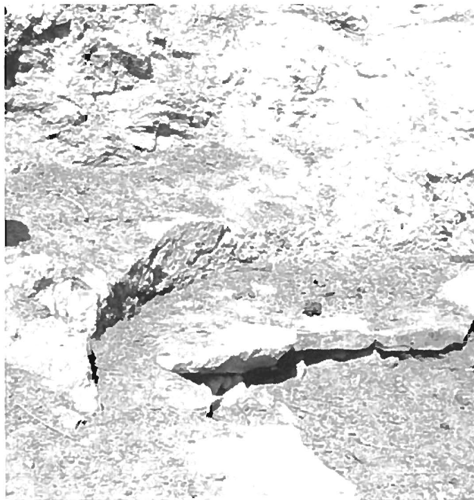
Fig. 1 – The cistern.

cistern. Thus, if the cistern were filled from the stream, only a short canal would be necessary to transfer water to the cistern. Although we found no evidence for such a canal it should be noted that the area in question is now under the village. There is, however, a narrow stone lined channel, about 25 centimetres in width, running diagonally down the side of the fortress. It starts high on the side and ends immediately alongside, but outside of, the cistern. Its physical connection to the cistern and its function is not clear.