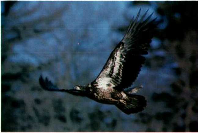
Fig. 4. Immature or subadult Bald Eagle. Note white underwing and "wingpit."