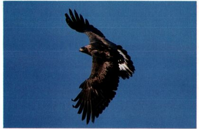
Fig. 5. Immature or subadult Golden Eagle. Note white at base of tail.

tail. In some cases, a more or less complete terminal tail band is present. Subsequent adult plumages are alike, however even older adults can show brown and black spotting in the white of the tail.