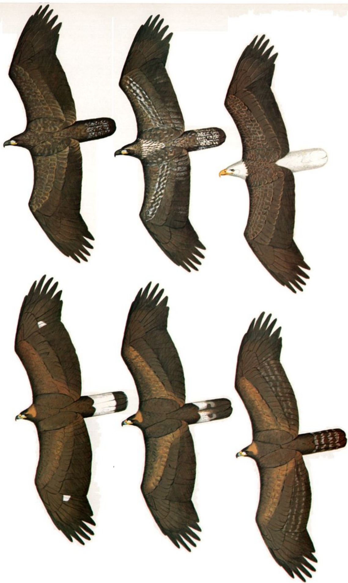
Fig. 3b. Eagles as seen from above. Top, Bald Eagle (l. to r. dark immature, white belly and mottled, adult), below, Golden Eagle (l. to r. immature, sub-adult, adult).