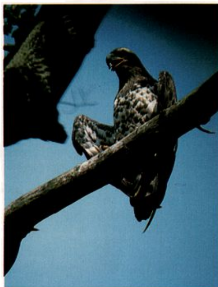
Fig. 1. Immature Bald Eagle showing white belly.

White Belly. The next plumage is usually completed by the end of the first year of age. The most prominent feature is the white belly, which has some dark brown marks on it. The upper breast remains