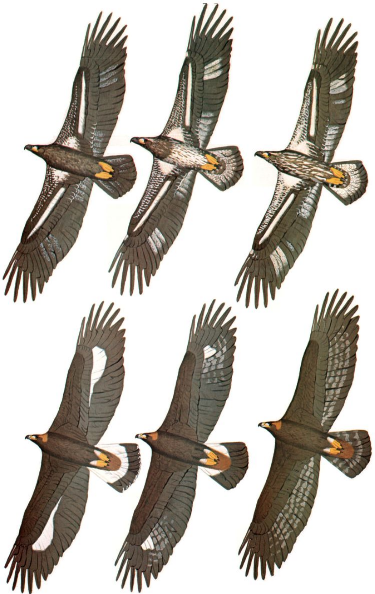
Fig. 3a. Eagles as seen from below. Top, Bald Eagle (l. to r. dark immature, white belly, mottled), below, Golden Eagle (l. to r. immature, sub-adult, adult).