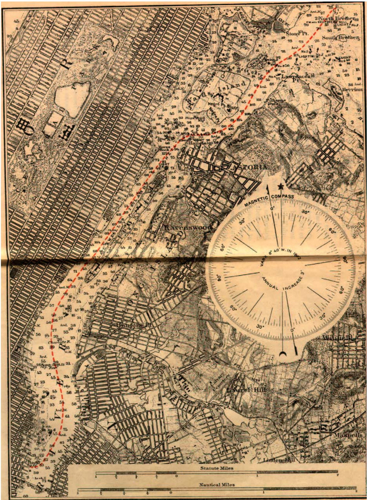
CHART SHOWING COURSE OF "GENERAL SLOCUM" ON JUNE 15, 1904, AND LOCALITY OF DISASTER.

Dotted red line indicates course of steamer.