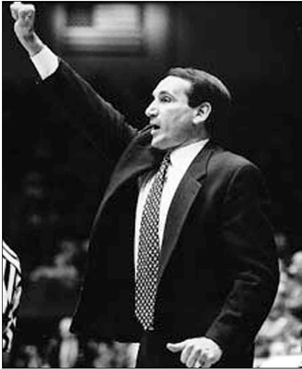
Mike Krzyzewski's Duke team has had the top scoring offense for the last two years.