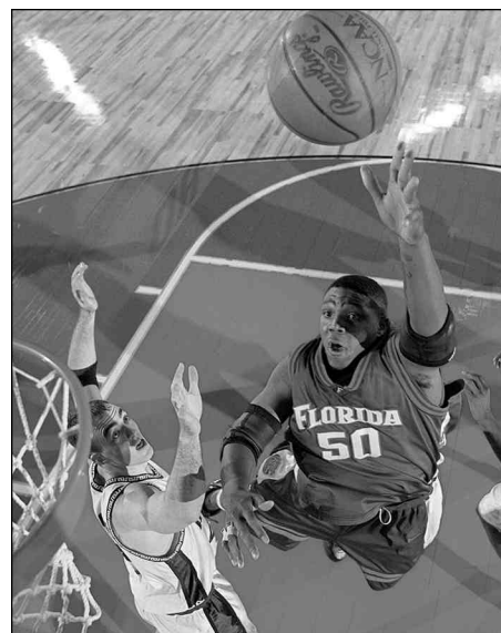
Florida's Udonis Haslem drives to the hoop during the championship game.