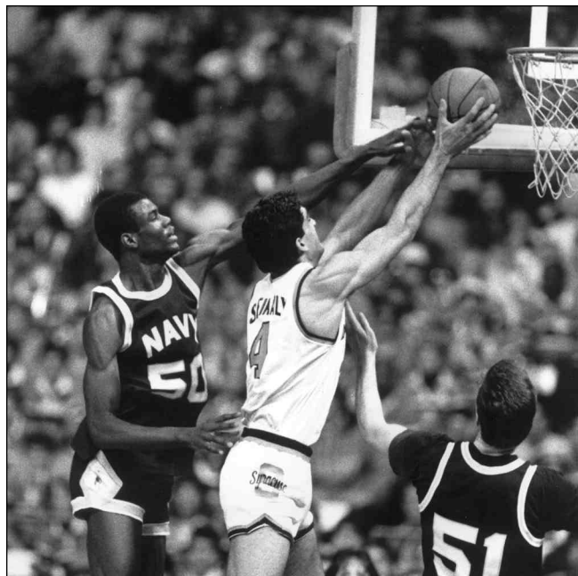
Navy's David Robinson set the single-season standard for blocked shots in 1986.