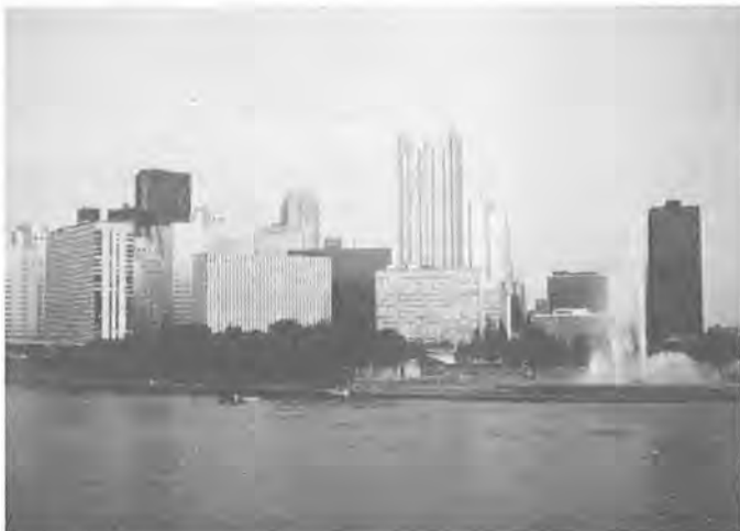
Downtown Pittsburgh, Pennsylvania