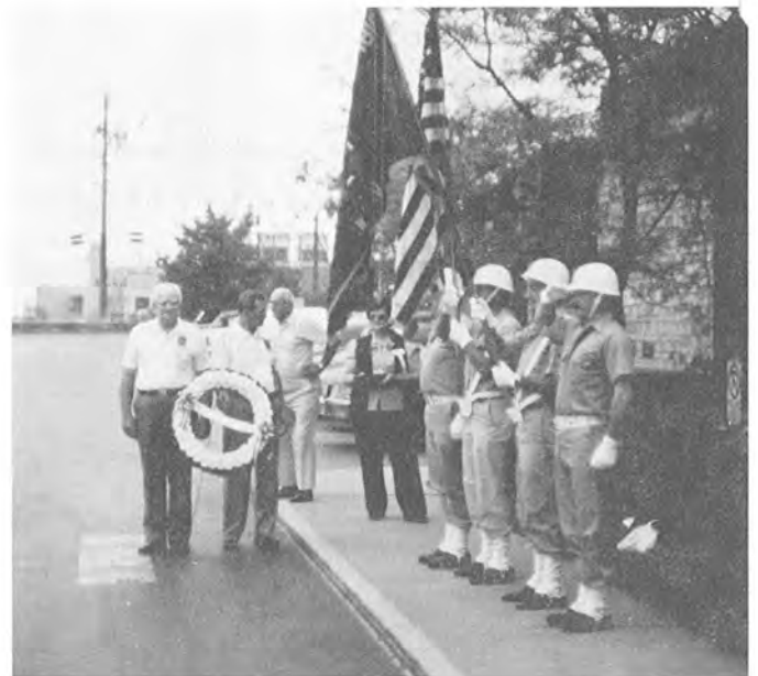
Honor Guard at Memorial Service Flag Pole, Pittsburgh Greentree Marriott

1988 69th ANNUAL REUNION LEXINGTON, KENTUCKY