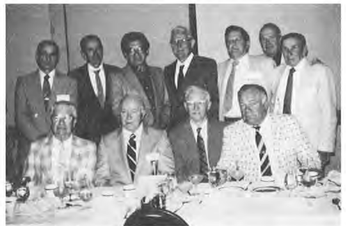
Company H, 273rd Infantry

1988 69th ANNUAL REUNION LEXINGTON, KENTUCKY