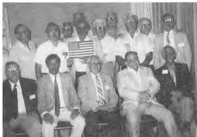
Men of Company-E, 271st Infantry attending the Pittsburgh Greentree Reunion.