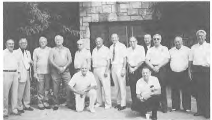
First Timers — Pittsburgh Reunion