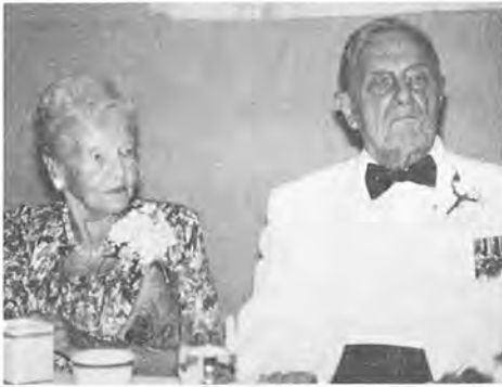
Adelaide Bolte - General Charles Bolte