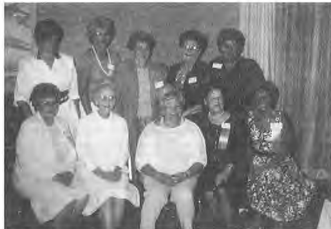
Ladies of Company-E, 271st Infantry attending the Pittsburgh Greentree Reunion.