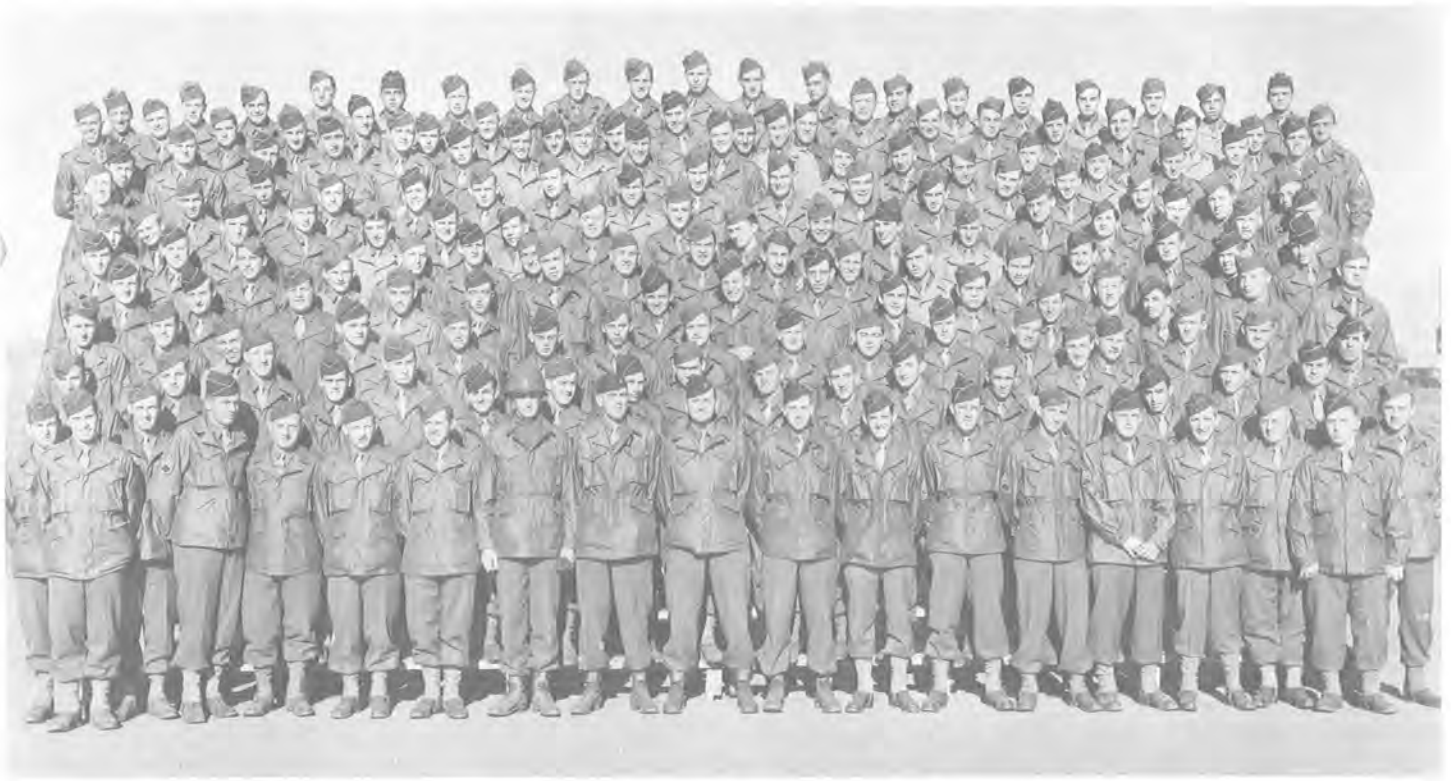
Company F-271st Infantry Regiment Picture taken at Camp Shelby in October, 1944