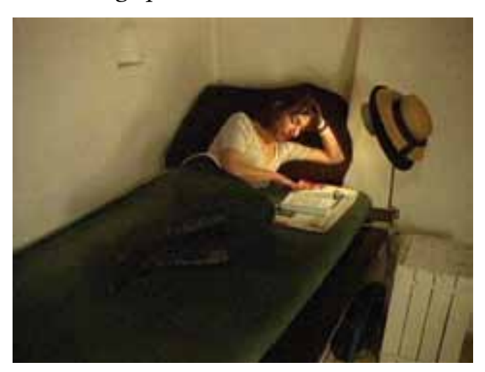
La animación, una habitación propia para la mujer creadora (This Could Be Me, Michaela Pavlátová, 1995).

The late appearance of these self-portraits endowed them with distinguishable signs of identity, establishing a divergence from the professional model created by men, first depicted by Winsor McCay and followed by the Fleischer Brothers in their series Out of the Inkwell (1921-27), who fashioned a cliché for cartoon comedy. Different to this idea of the animator as demiurge of a fictional universe, women have proposed a model closer to documentary, thanks to the following contributions: 1) the emergence of a variety of spatial contexts; 2) diversity of characters' typologies; 3) multiplicity of voices; and 4) the introduction of autobiographical elements .