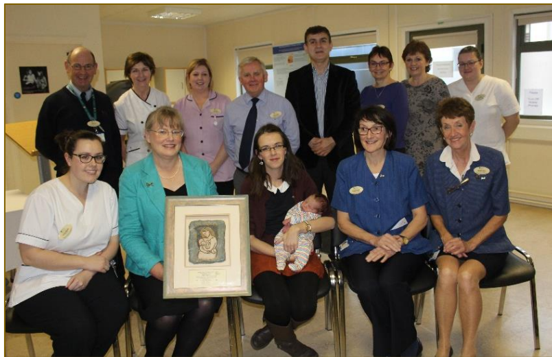
Limerick University Maternity Hospital, Nov 2016

The intention was to progress the BFHI Ireland expansion to include assessment of neonatal practices in line with the international BFHI-Neo assessment tools. These tools had been piloted in two Irish hospitals and the development of supporting materials started in 2015. Due to funding restrictions this expansion did not take place in 2016 as planned.