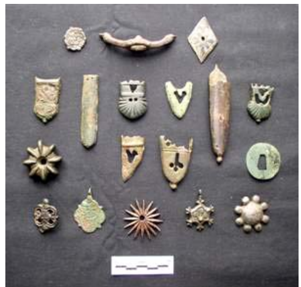
Plate 15 A small number of the recorded artefacts from the battlefield at Towton, Yorkshire

If no artefacts from a conflict are found in a given area it does not mean that the conflict did not take place on that site. A multitude of factors dictate whether or not a site incorporates such evidence, many of which are not predictable. For example, most or all of the artefacts might already have been removed from the area by metal detectorists or farmers, in which case it will be increasingly difficult to find any remaining evidence. However, the person or persons who removed such artefacts might be willing to discuss such evidence, if they could be contacted, and could point to where it was found. During the initial stages of the Towton Battlefield Archaeology Survey, Simon Richardson, a metal detectorist who had been working on the site for many years, provided information, which helped to map the evidence recovered from his previous searches