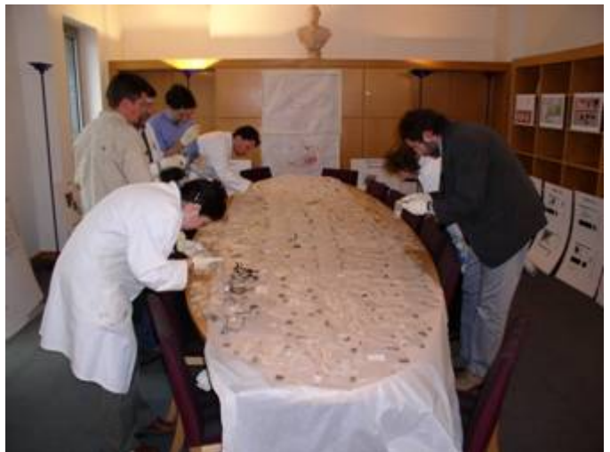
Plate 1 Experts from the Royal Armouries, Leeds analyse some of the fifteenth century artefacts recovered as part of the Towton Battlefield Archaeological Survey

The problem with many sites of conflicts is that actual remains of the event, the obvious physical heritage, rarely survive above ground. If archaeological evidence cannot be seen, it is less likely to be recorded and protected, as 'popular' heritage sites are generally those where the remains of the 'site' can be viewed. This failing is plainly exhibited in English Heritage's 'Conservation Bulletin of the Historic Environment' (Dorn 2003, 7), entitled The Archaeology of Conflict . Of the 64 pages devoted to the topic, only one eighth of one page is devoted to battlefields themselves, that is, to the sites where conflict actually took place. The remainder of that document discusses Britain's defensive sites, prisoner of war camps, cold war bunkers and airfields etc. Very few of these topics cover the physical remains of actual conflict. This example illustrates the problems associated with the archaeology of battlefields – they are rarely discussed because of their apparently vague and ephemeral nature. However, the contrary is true: battlefields are repositories of a vast amount of significant and virtually untapped historical information (Plate 1).