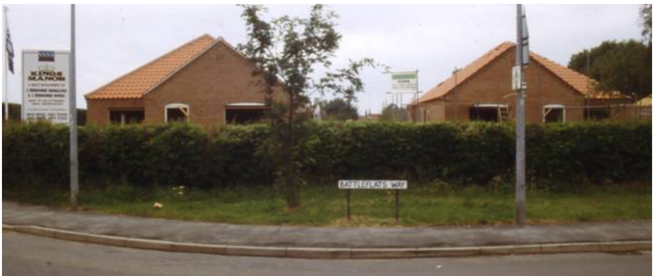
Plate 10 Battleflats Way, on the site of the 1066 Battle of Stamford Bridge, Yorkshire, which has been destroyed due to a housing development

Several housing or industrial developments have either destroyed or had the potential to destroy the sites of famous British battlefields. In 1997, at Stamford Bridge, England for example, a housing development covered the site of the 1066 battle on Battle Flats (Plate 10). In the same year, however, English Heritage and lobby groups, including The Battlefield Trust, prevented the construction of a housing estate on 'The Gastons' , the site