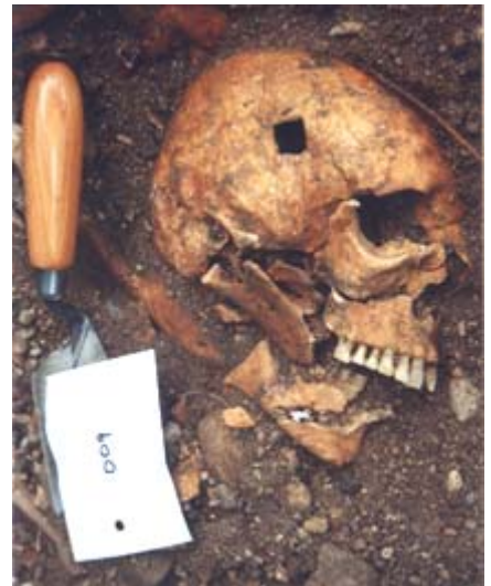
Plate 9 The skull of Skeleton 9 from the 1996 Towton mass grave