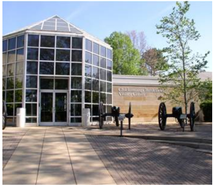
Plate 4 Chickamauga Battlefield Visitor Centre, Tennessee, USA

The conflict should not be overtly glorified in the museum; on the contrary, the factual evidence of the actual conflict should illustrate the views of both factions as well as the sequence of events. This can be simply expressed in an educational format that is both informative and interesting. The sites of these visitor attractions also rejuvenate an often rural local economy, and provide individuals of all ages with a greater understanding of a country's, or a specific region's formative periods in time.