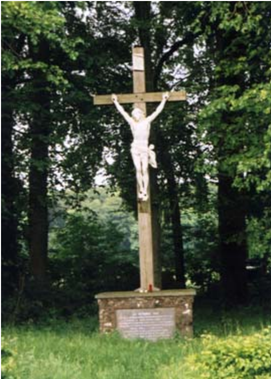
Plate 3 The memorial cross on the battlefield at Azincourt, France

If, however, the memorial itself is not on the battlefield, the focus can become detached from the site of the conflict. The connection between the battlefield and the memorial could later be lost, as the memorial itself becomes the symbol of the event. This highlights the need to physically record where the boundaries of conflicts lie, as there are cases, such as the battle of Bosworth Field, Leicestershire, where the exact location of the battlefield is uncertain and therefore its limits are unknown. On the battlefield of Agincourt, France (1415), the site of the graves is seen as the focus of the battlefield (Plate 3), although there is contradictory evidence to suggest that the battlefield might lie elsewhere (Sutherland, forthcoming 1).