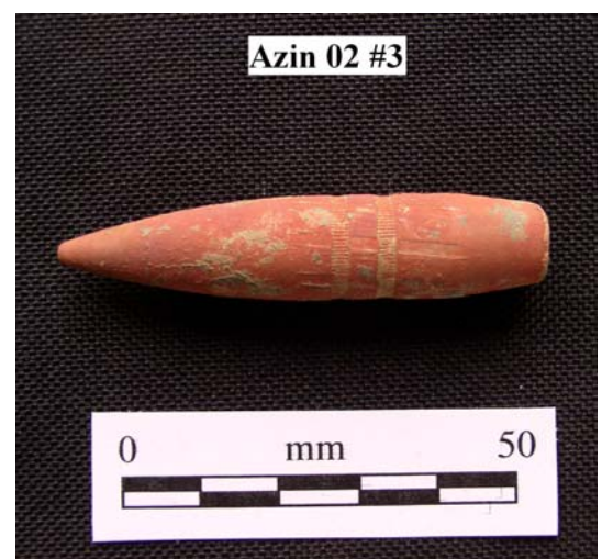
Plates 13 & 14 Musket ball and Second World War bullet recorded on the Agincourt battlefield