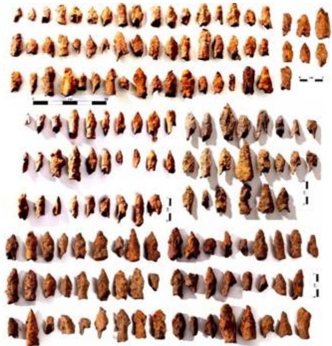
Plate 12 Medieval arrowheads discovered during the Towton Battlefield Archaeological Survey

At Towton, for example, fluxgate gradiometer surveys carried out over an area of known medieval arrowheads (Plate 12) failed