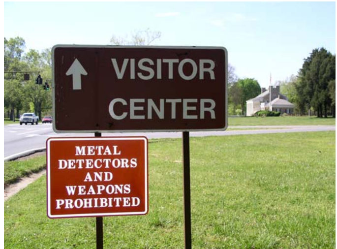
Plate 11 Signage close to the Chickamauga Battlefield Visitor Centre, Tennessee, USA

The fluxgate gradiometer is best used for locating sub-surface archaeological features, such as ditches or fired features, such as hearths or kilns. The instrument generally incorporates a logging device to record the instrument readings. It is generally effective to a depth of around 50cm depending upon the strength of the magnetic disturbance. For example, a wire fence or a large ferrous anomaly