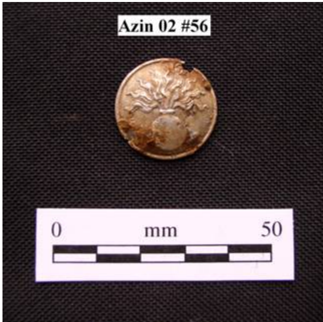
Plate 2 A modern British military button recovered from the medieval battlefield at Azincourt, France as part of the archaeological survey

of ancient or historical conflict. The term ‘battlefield archaeology’ is slightly misleading, as the subject generally focuses on the archaeology of the event, such as the battle, rather than the field on which it took place. The term ‘the archaeology of battle’ is therefore often used as a more precise description of the discipline. However, the archaeology of battle should, in reality, be incorporated into one of the aims of a ‘battlefield project’ as it is virtually impossible not to encounter the archaeological remains of other periods or events whilst the project is being carried out.