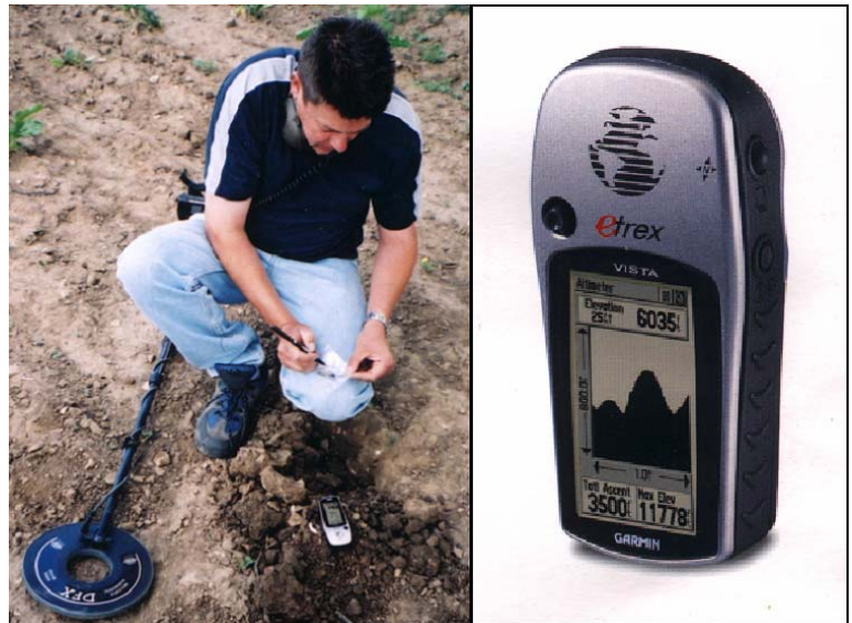
Plate 16 Recording the location of an artefact found during a metal detecting survey, with a GPS, as part of the Towton Battlefield Archaeological Survey

(Plate 15). This evidence has been used to construct hypotheses as to where other artefacts might be located, eventually leading to other and increasingly successful prospection surveys. Richardson now records all his finds using a satellite, GPS (Global Positioning System), therefore helping to construct an ever-increasing accurate location map of the battlefield at Towton (Plate 16).