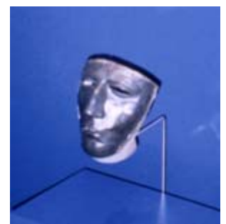
Plate 8 A Roman military 'mask' or helmet faceguard from the Varus Battlefield, Germany

In 1995, Foard published evidence that had been collected by metal detectorists who were searching the battlefield at Naseby, Northamptonshire, England (Foard 1995). This was probably the first example of the publication of archaeological evidence gained directly from an assemblage of artefacts, which was used to confirm the site of a major British battle.