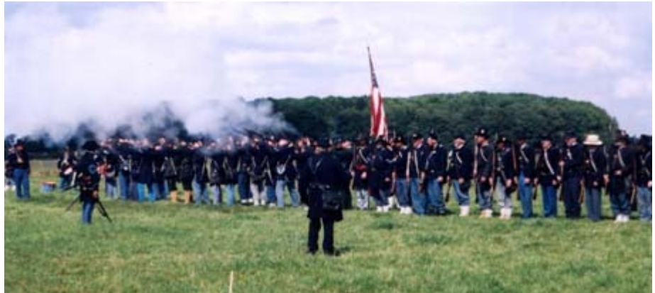
Plate 5 A re-enactment, in Britain, of a battle from the American Civil War

An article in ‘The Archaeologist’, the Institute of Field Archaeologist’s own journal, enthusiastically suggests that