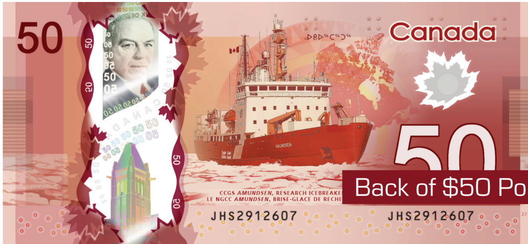
Back of $50 Polymer Note