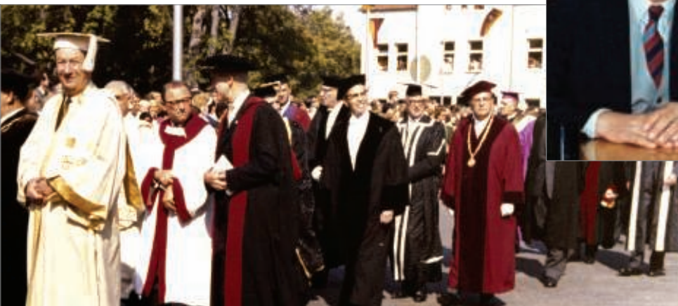
Representing Ankara University as its rector, at the meeting of European rectors at Göttingen, Germany (1964)