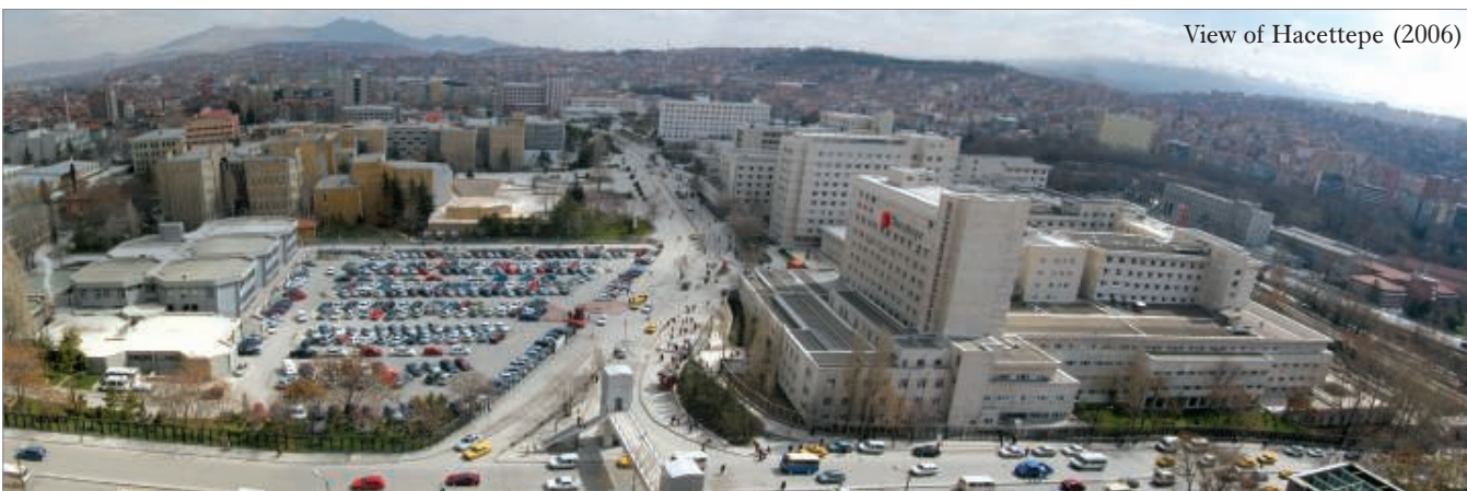
View of Hacettepe (2006)