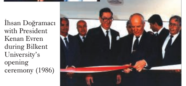
İhsan Doğramacı with President Kenan Evren during Bilkent University's opening ceremony (1986)