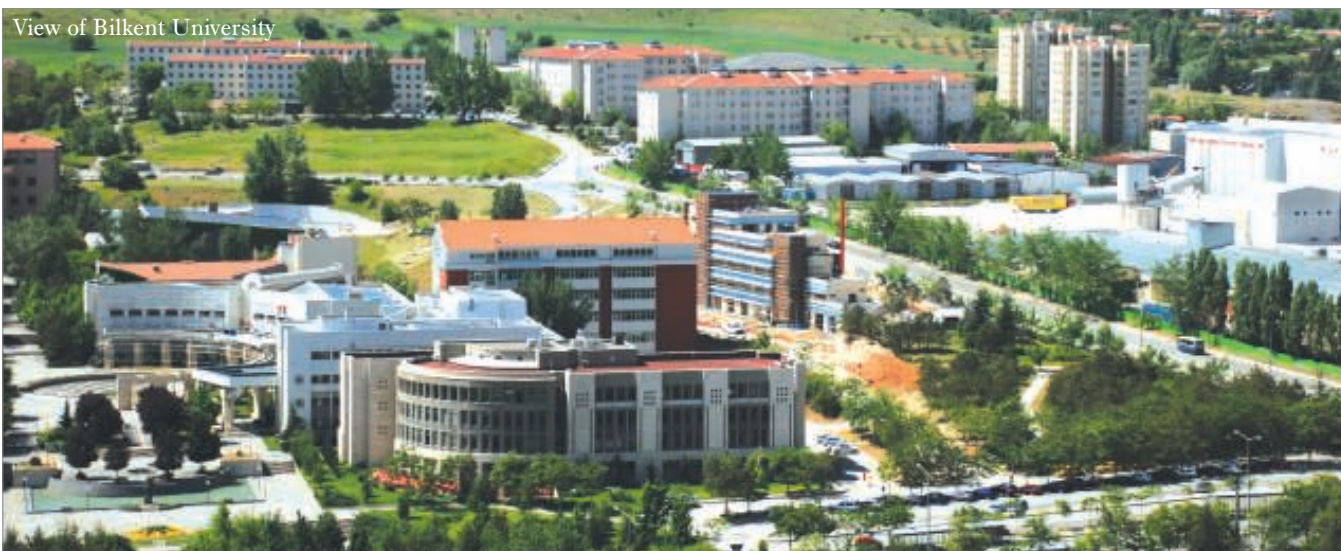
View of Bilkent University