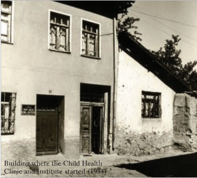
Building where the Child Health Clinic and Institute started (1954)