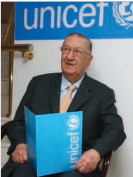
He was celebrated as Mr. UNICEF for many decades