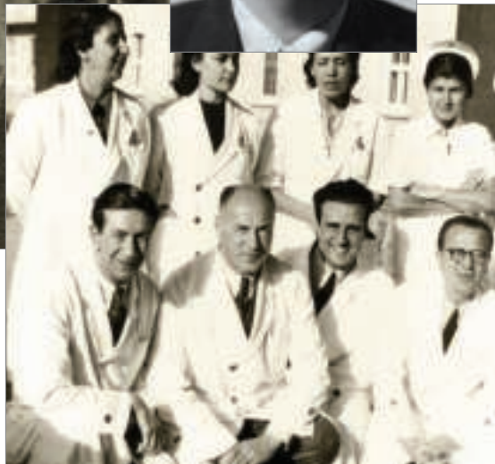
Associate Professor İhsan Doğramacı (1949)