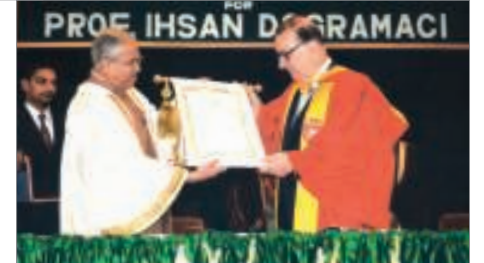
Receiving an honorary doctorate at Jamia Millia Islamia (National Islamic University) in India

In 2007, the Bureau voted unanimously to honor Prof. Dođramacı with the prize, citing his outstanding service to Turkish education, including the founding of Bilkent and Hacettepe Universities, as well as his academic contributions in the field of medicine. He received the award at a ceremony held on May 30 of that year.