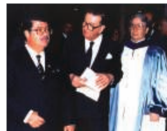
İhsan Doğramacı with Prime Minister Turgut Özal and Rector Mithat Çoruh during Bilkent University's opening ceremony (1986)