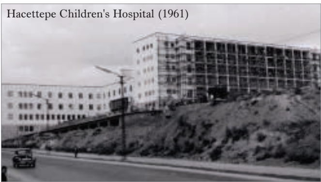
Hacettepe Children's Hospital (1961)