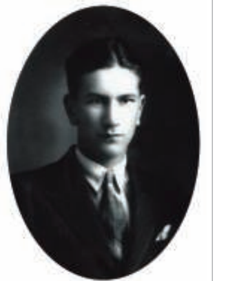
İhsan while a student at the Preparatory School of the American University of Beirut (1930)

While İhsan was studying in Beirut, his father had become a senator, and the family had moved to Baghdad. When İhsan rejoined them, he entered the Baghdad College of Medicine, a school largely run by British teachers upon the basis of the Edinburgh University curriculum. He studied there for three years, but was never able to feel at home in Baghdad. He had always wished to go to Turkey, and so in 1936 he left for İstanbul, where he was accepted into the University of İstanbul, School of Medicine and proceeded to apply himself single-mindedly to his studies. His colleagues already regarded him as different from themselves. Their aim was to work toward getting a degree and a job, and they were content within those limits. But even at that early stage, İhsan Doğramacı was looking much farther ahead.