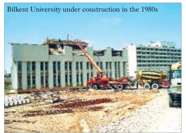
Bilkent University under construction in the 1980s