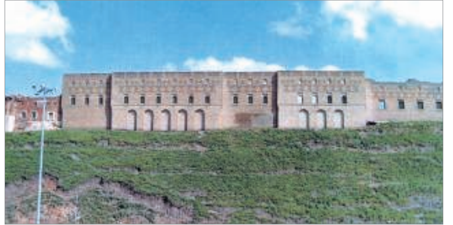
The citadel of Seljuk ruler Muzaffereddin Gökborü's capital Erbil in northern Mesopotamia - İhsan Doğramacı was born in a house within the citadel