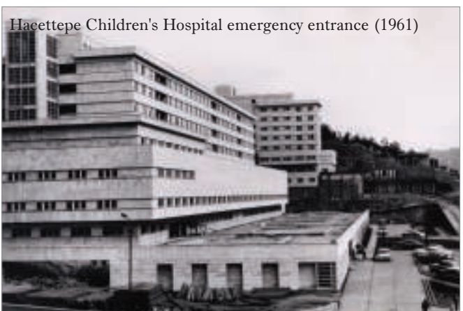
Hacettepe Children's Hospital emergency entrance (1961)

In the 1940s, when İhsan Doğramacı was studying in the United States at Harvard University and Washington University, he became acquainted with private, non-government organizations and universities.