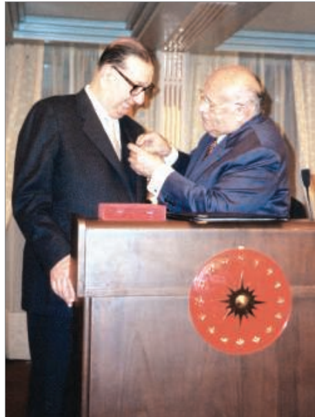
Being presented with the Republic of Turkey State Medal for Outstanding Merit by President Süleyman Demirel (1995)