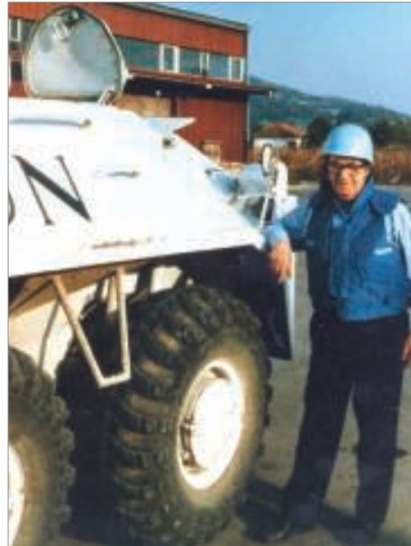
Prof. Dođramacı beside a UN vehicle during the conflict in Bosnia (1992)