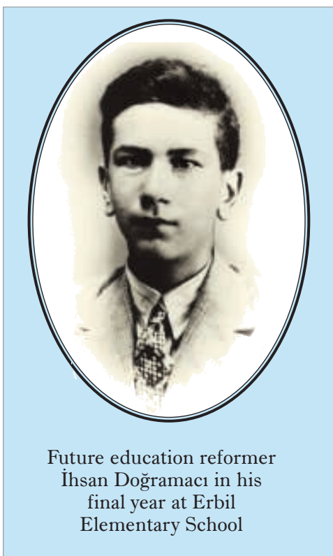
Future education reformer İhsan Dođramacı in his final year at Erbil Elementary School

Encompassing nearly a century, İhsan Dođramacı's life was characterized by a deep and enduring interest in the needs of young people, whether children in the pediatric wards of hospitals or students in universities. His goals in these areas were both national and global. His commitment to improve health care and education in his homeland, Turkey, was always paralleled by a broader vision which rested on a pragmatic and humanistic understanding of transnational interdependence. Although the circumstances into which he was born and the times in which he lived played a part in the enormous success he achieved, his impact upon Turkey and throughout the world derived ultimately from his focus on a set of ideas and ideals and a personal strength of will that drove him ever forward to achieve what he saw as necessary and beneficial.