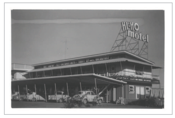
Hi Ho Motel, Queensland Avenue, Broadbeach (1958)