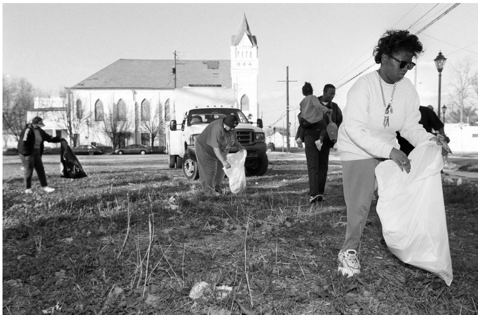
Figure 2. Northeast Augusta chapter of the Gospel Music Association of America, Inc., cleans up Brown's childhood neighborhood.