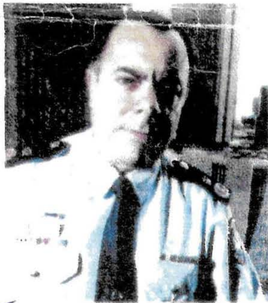
Deputy Commissioner Kaldas.

POLICE have vowed to take the fight to Sydney's gun-toting criminals to end the scourge of deadly shootings, adopting a hardline approach similar to that used by heavily armed New York cops in the aftermath of the September 11 terror attacks.