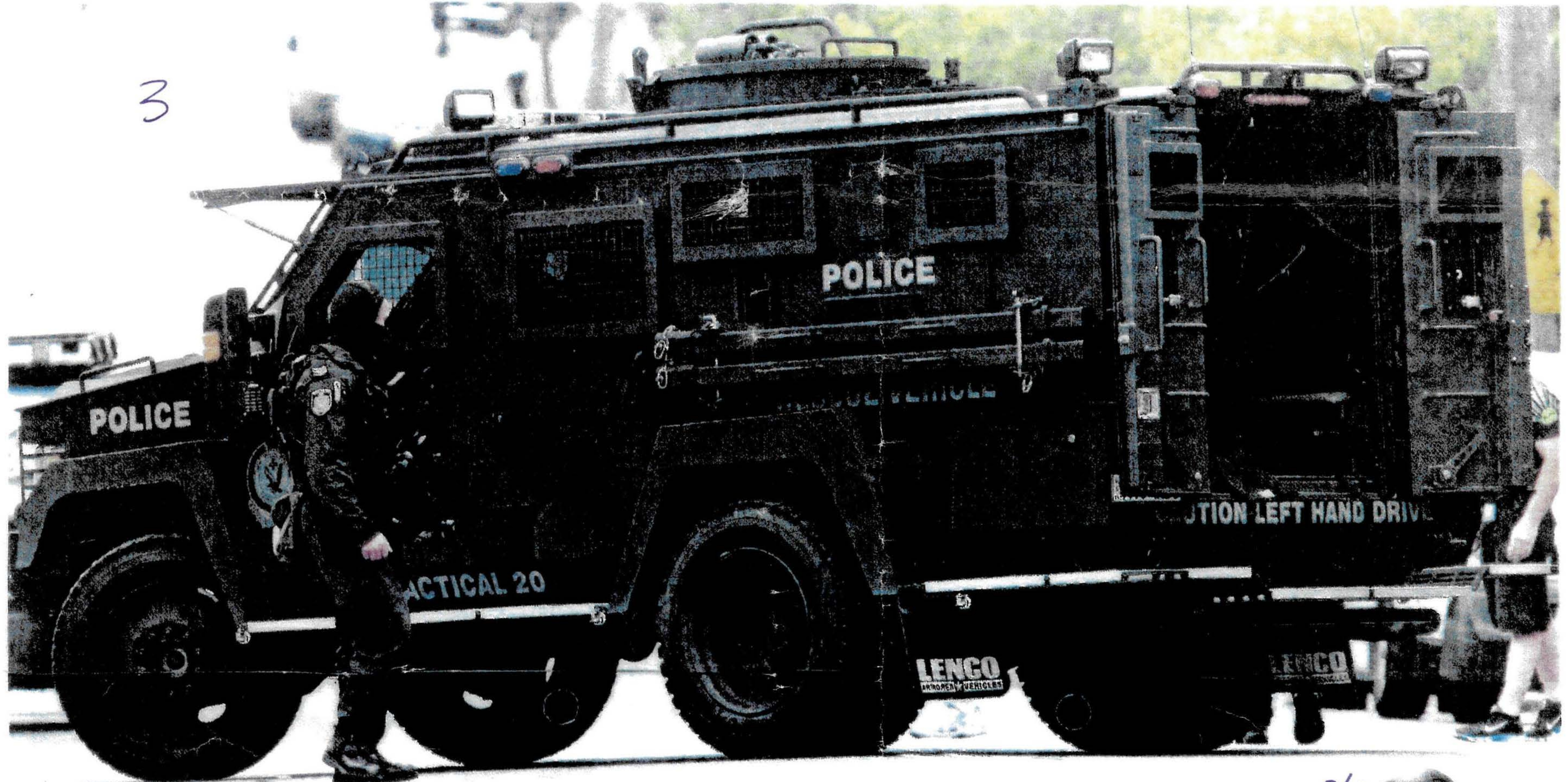
NSW Police wants to relax rules governing the use of the Bearcat so it can be deployed to fight gun crime and (right) a New York cop taking part in Operation Hercules.

Police model gun crime tactics on New York's 9/11 response