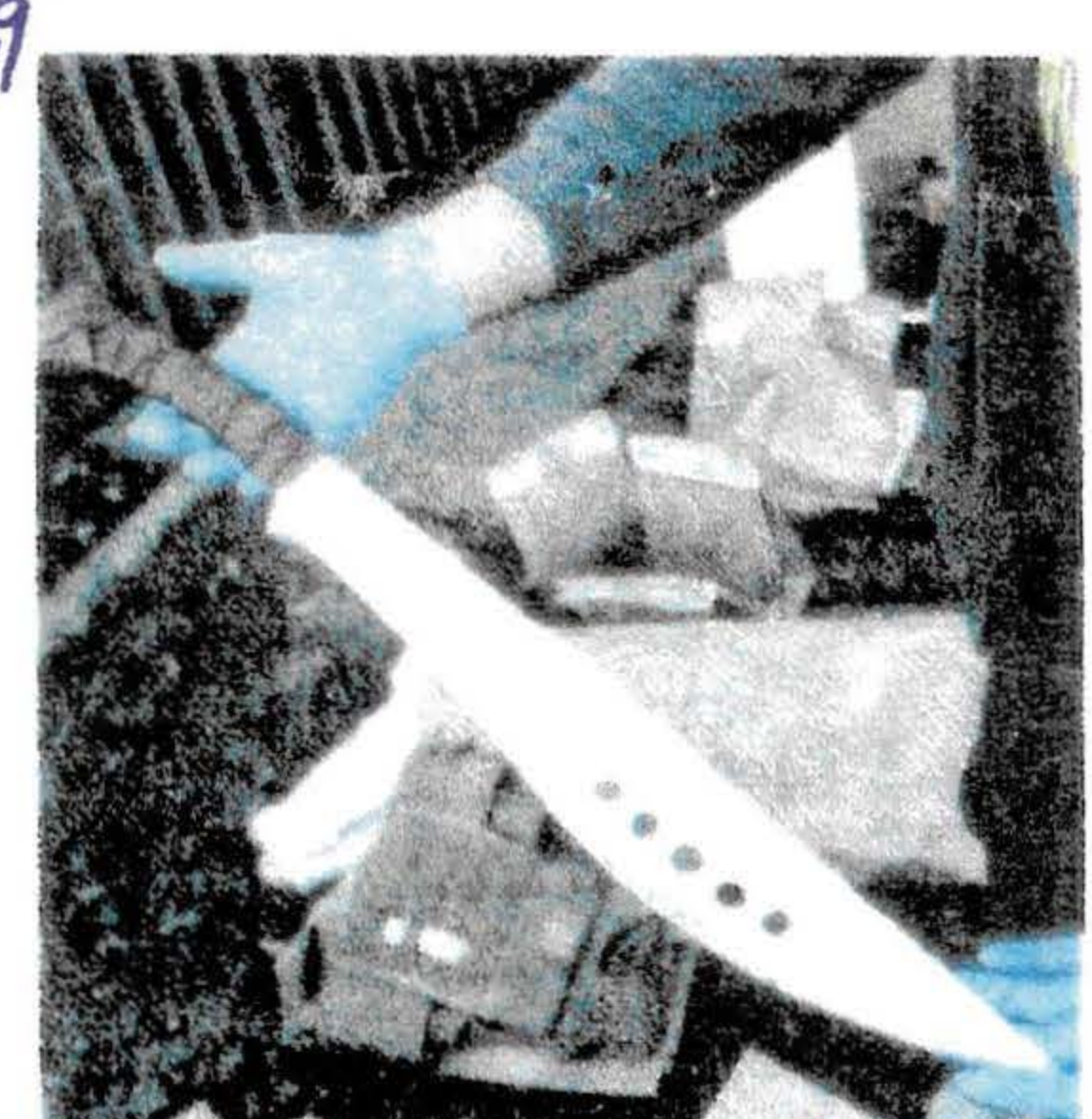
A knife discovered by police.

Zoef did not apply for bail, which was formally refused.