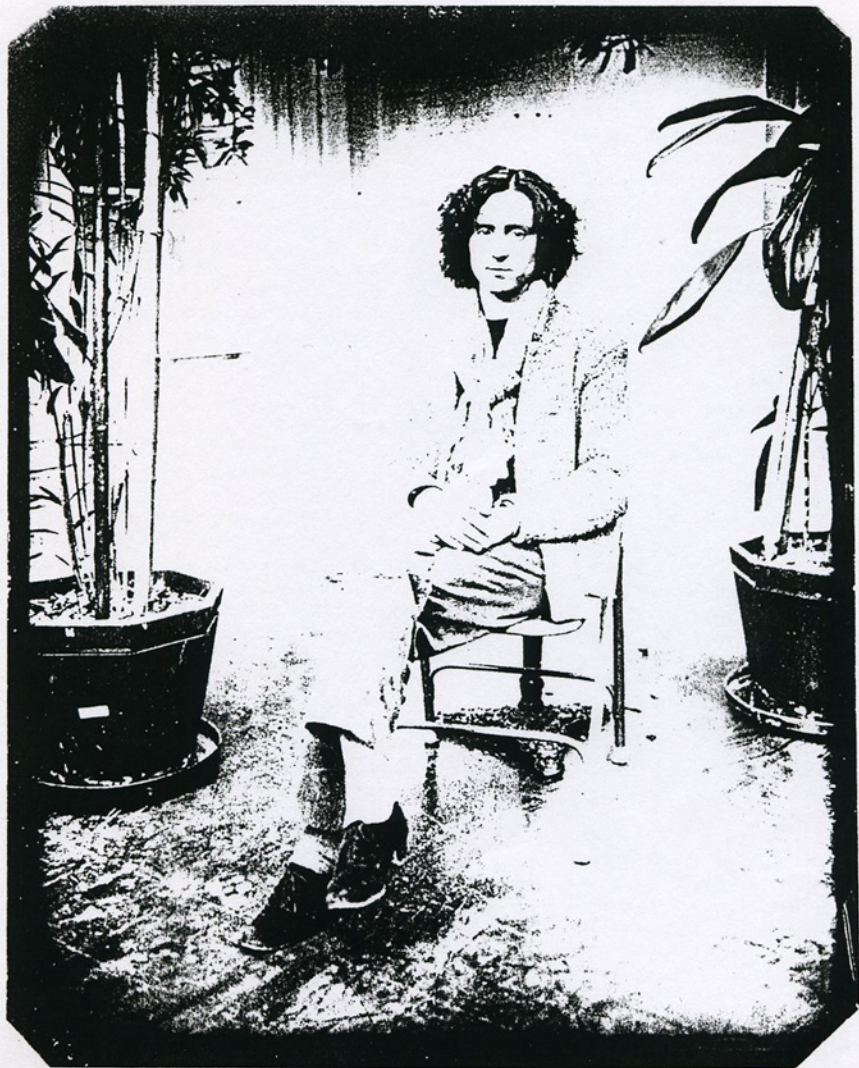
Fig. 2: "Anne Cartier-Bresson," by Kenneth E. Nelson, 1980. Daguerreotype: 4x5 inches (roughly half-plate). (Collection of K. Nelson)