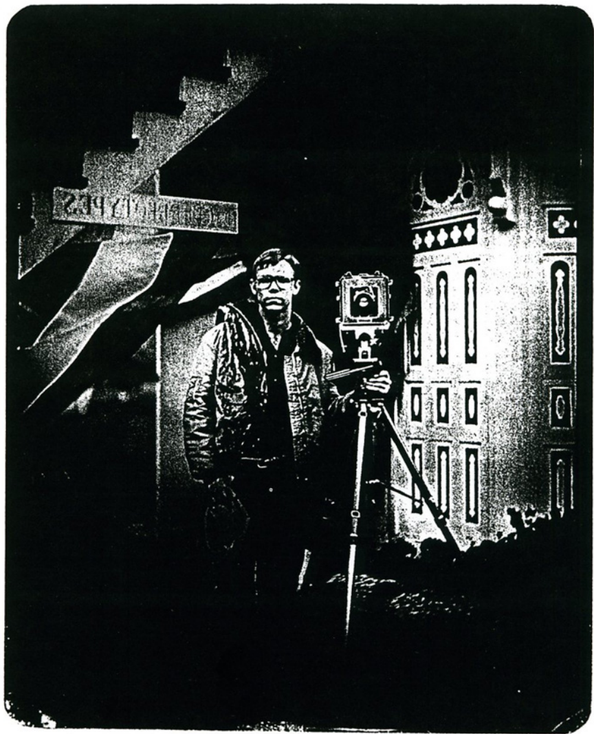
Fig. 6: "Alan Brown," by K. Nelson, 1980. Made with a sixth-plate Petzval-type lens by C.C. Harrison, ca. 1860. (The field of the sixth-plate lens could not cover the 4x5 inch [roughly half-plate] format of this daguerreotype, hence the strong vignetting. A lens designed to cover a half-plate format would not exhibit this tendency.) (Collection of Alan Brown, Victor, New York)