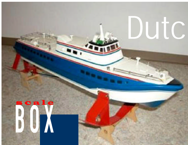
LEFT + BELOW: The PT.50 as it appeared when acquired by Theo Bakker. The model was manufactured in Japan in the 1980s and is radio-controlled