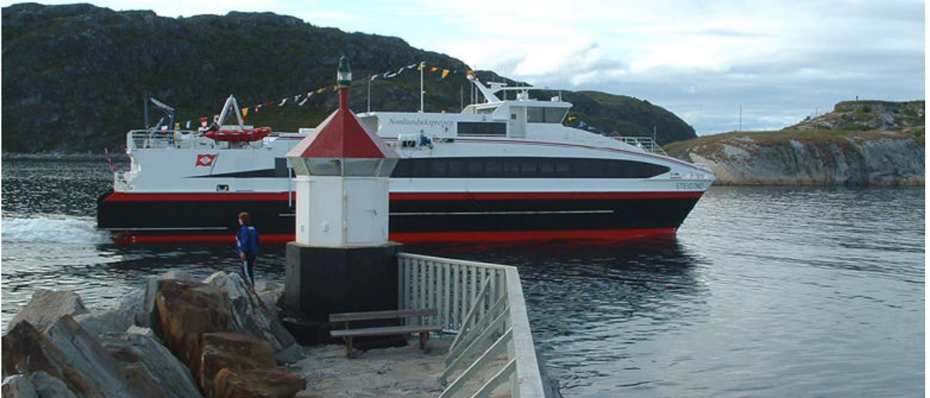
One of the two Austal Ships/Image Marine 41.3m cargo/passenger catamarans, Steigtind, that entered service with OVDS in north Norway this summer

The pair of Austal Ships 41.3m cargo/passenger catamarans built in Western Australia by Imagine Marine for Norwegian operator Ofotens og Vesteraalens D/S were officially named Salten and Steigtind in a ceremony at Bodø in northern Norway on July 19. Shipped from Fremantle, as deck cargo, on May 17, the new catamarans arrived in Norway somewhat late and could not make it to the initial christening date of June 24.