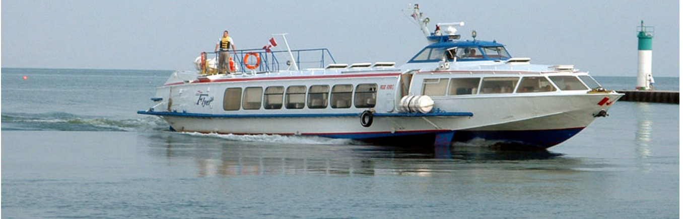
Voskhod Pelee Flyer 1 entered service on Lake Erie between Kingsville and Pelee Island, Ontario, Canada this summer

Pelee Hydrofoil Corporation, a company based in Kingsville, Ontario Canada, has acquired a pair of Voskhod hydrofoils and introduced them on a new service on Lake Erie between Kingsville and Pelee Island.