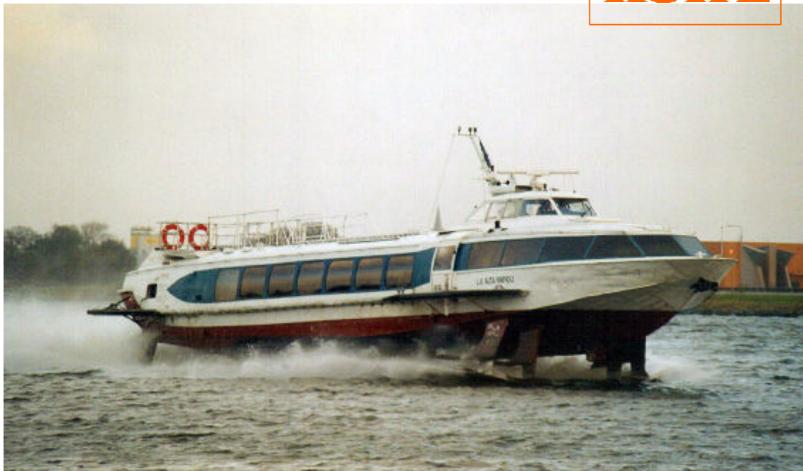
Voskhod La Alta Rapido in the old Fast Flying Ferries colors on a drizzly October day last year. The hydrofoil has since been sold and shipped to a company in Malaysia