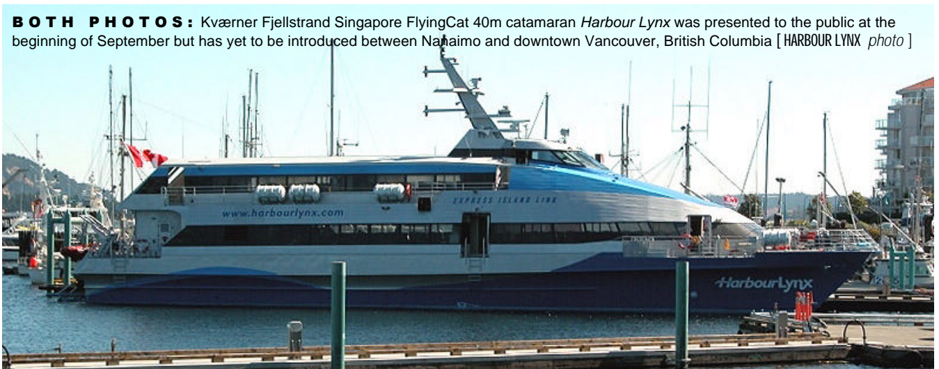
BOTH PHOTOS: Kværner Fjellstrand Singapore FlyingCat 40m catamaran Harbour Lynx was presented to the public at the beginning of September but has yet to be introduced between Nanaimo and downtown Vancouver, British Columbia

awaiting final documentation and approvals from Transport Canada. Until November 30, three round trips have been scheduled every day of the week; on Monday–Friday these leave Nanaimo at 0715, 1045 and 1530 and Vancouver at 0900, 1230 and 1730. On the weekend all departures are one hour later. Transit time for the 37 nautical mile route is approximately 75 minutes.