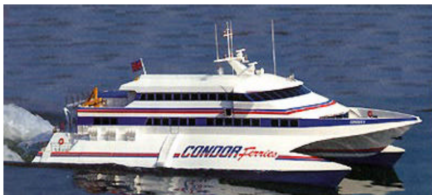
BELOW: Graupner's waterjet-driven model of Condor's Incat/Aluminium Shipbuilders 49m wavepiercing catamaran Condor 9

Last month Theo came across another interesting model which isn't a hydrofoil but a true-to-the-original replica of the Incat/Aluminium Shipbuilders 49m wavepiercing catamaran Condor 9 that Condor operated between the UK/France and the Channel Islands in 1990–2002.