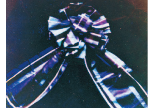
Maxwell's first colour photograph of the 'tartan ribbon'

Here, there is a roller display summarising the first full colour projected image, famously demonstrated by Maxwell in 1861 at the Royal Institution in London. He achieved this by making three black and white photographic plates which were photographed through red, green and blue filters respectively. He then used three magic lanterns to superimpose these three black and white images, each projected through the same red, green and blue filters, to produce the above first colour image of the 'tartan ribbon'.