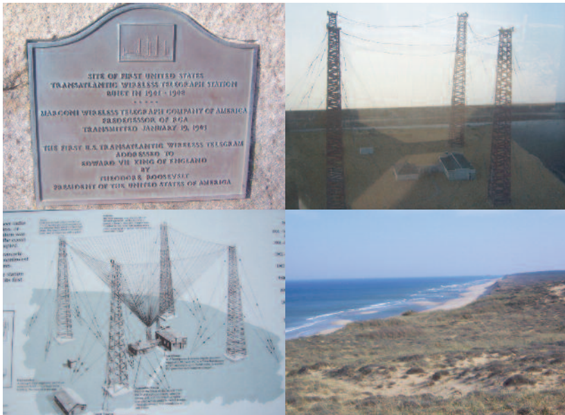
Photo montage from Marconi's wireless telegraphy station, Wellfleet, Cape Cod, USA

Below the paintings is a display of a spark generator and wireless receiver on loan from the Museum of Communication, in Burntisland in Fife. These link to the foyer poster ‘Maxwell to Marconi’, which commemorates the centenary of the first cross-channel wireless signal in 1899 followed by the first transatlantic signal in 1901. The receivers are displayed on the base of a bookcase gifted by the Cavendish Laboratory together with the writing desk below the Robert Hodshon Cay portrait. Both items had been in the first Cavendish Laboratory, designed by Maxwell when he came out of retirement to return to Cambridge as its first director and Professor of Experimental Physics from 1871 – 1879.