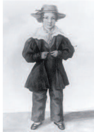
James Clerk Maxwell as a child

The cost of refurbishment was met by grants and loans, some of them conditional on bringing the interior as close as possible to that of the late Georgian era, when the family lived here. James's father, John Clerk Maxwell, had inherited the estate of Glenlair in Galloway in southwest Scotland and divided his time between Glenlair and this town-house. James was born here in Edinburgh on 13 June 1831 and the Clerk Maxwell family moved back to Glenlair permanently when James was two years old.