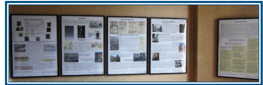
Exhibition room II wall panels on Maxwell's childhood, career and poetry

This brochure is provided as a reminder of your visit to 14 India Street by the James Clerk Maxwell Foundation www.clerkmaxwellfoundation.org