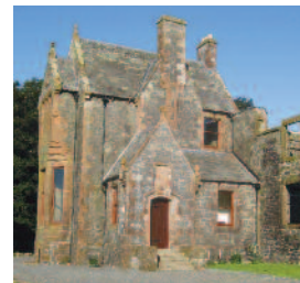
Restored porch at Glenlair in 2000

The bookcase features books by and reflections on the life of Newton, Kelvin, Faraday, Maxwell etc. The 9th Edition of the 1886 Encyclopaedia Britannica, in the lower right hand corner, features Maxwell's scientific contributions in 15 of the 33 volumes: Electricity – Vol. 8, p 40; colour printing Vol. 32, p 16, etc