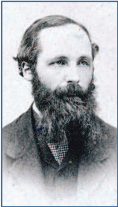
Maxwell

While this was a great step forward, quaternions proved to be less than popular. Oliver Heaviside, who was a keen proponent of Maxwell's theory, saw the need to restate the equations and so in 1885, just a few years after Maxwell's death, he developed the now familiar vector form, simplifying some of them in the process. However, this was not quite the end of the story, for in the opening years of the 20th century Lorentz gave the equations a microscopic basis, highlighting the four equations on the statue, together with the Lorentz force, \mathbf{F} = q(\mathbf{E} + \mathbf{v} \times \mathbf{B}) , as the fundamental equations of electrodynamics. The final touch was due to J. Willard Gibbs, for it is his notation that we generally use today. The publication of his 1902 book on “ Vector Analysis ” eventually led to Heaviside's ‘div’ and ‘curl’ being replaced by Gibbs' \nabla \cdot and \nabla \times , but in all other respects the four equations we see on the statue are the direct result of Heaviside's tribute to Maxwell.