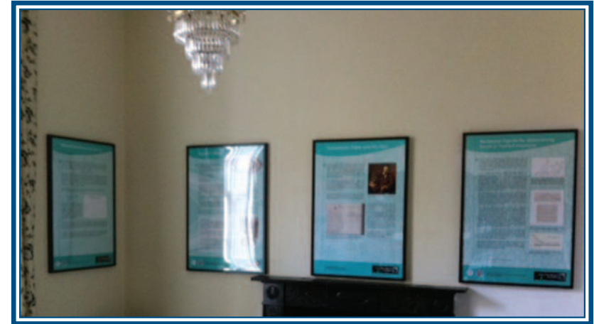
Library wall panels on Maxwell's many scientific achievements