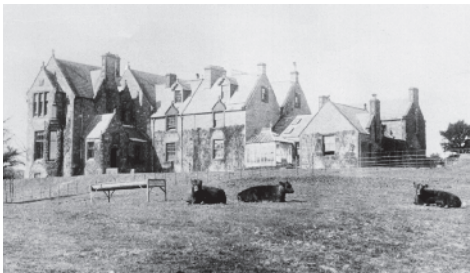
Glenlair in Maxwell's time, before the 1920's fire

This room, originally the Maxwell's dining room, is one of the best refurbished Georgian rooms in Edinburgh. The décor is characteristically subdued with most of the colour provided by carpet and curtains. The original structure of the room, including cornices, has survived although the chandelier is a recent replacement.