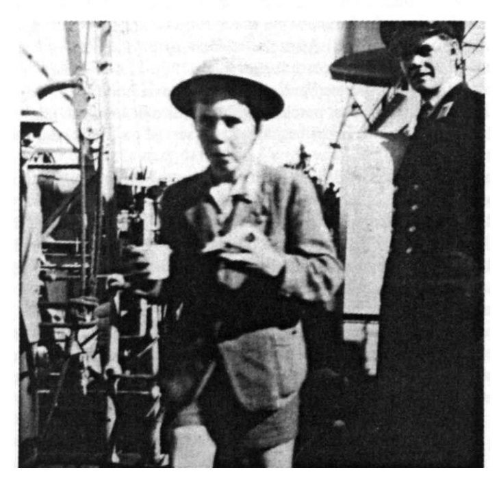
Figure 5: Tin hats, tea and tarts.