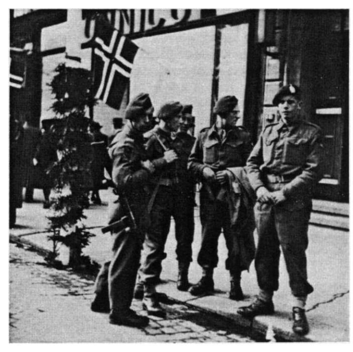
Figure 2: Members of the Norwegian Home Front and British airborne troops-all armed-were well represented.

Ashore, the same experience was repeated. We were mobbed on the streets by people wanting to talk to us in English, a language which had been prohibited for some five years. Others spoke Norwegian or used just a friendly sign-language. We quickly distributed the few treasures we had been able to carry with us, and we were given coins and flags and flowers in return for our autographs. Photographs of the Royal Family were exhibited in almost every shop window, and each display formed a centre of considerable interest to the Norwegians. It was a vast holiday crowd. Women and girls in national costume or summer frocks, blond, freckled boys in shorts, students of all ages wearing their black, tasselled student caps and sailors from the British, Canadian and Norwegian ships of the Task Force all mingled in one happy crowd of holiday-makers. Yet there was a grimmer side as well. The British airborne troops, Norwegian police, some Swedish-trained Norwegian soldiers and partisans, who were also part of the throng, were all armed with rifles or tommy-guns slung over their shoulders, and the Germans, who were still to be seen on the streets, wore pistols in their belts. The crowd, however, had little time for the former conquerors that day and they were largely ignored by liberators and liberated alike.