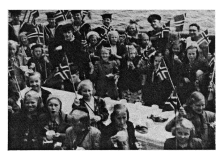
Figure 4: Some of Devonshire's guests enjoy tea on the upper deck during the children's party in Oslo, 18 May 1945.