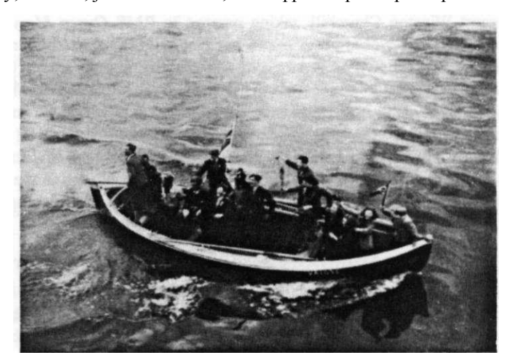
Figure 1: This was the first of hundreds of small craft which accompanied Devonshire up Oslo Fjord on Operation Kingdom.

The next forenoon we overtook the minesweeping flotilla and reduced speed to remain astern. All possible precautions were being taken for the safety of Apollo's royal passenger. In addition to the sweepers and our own paravanes, we had air cover all the way consisting of Sunderlands, Catalinas, Mosquitoes and Beaufighters. During the afternoon watch we sighted the coast of Norway; at 1930, just off the Naze, we stopped to pick up our pilots.