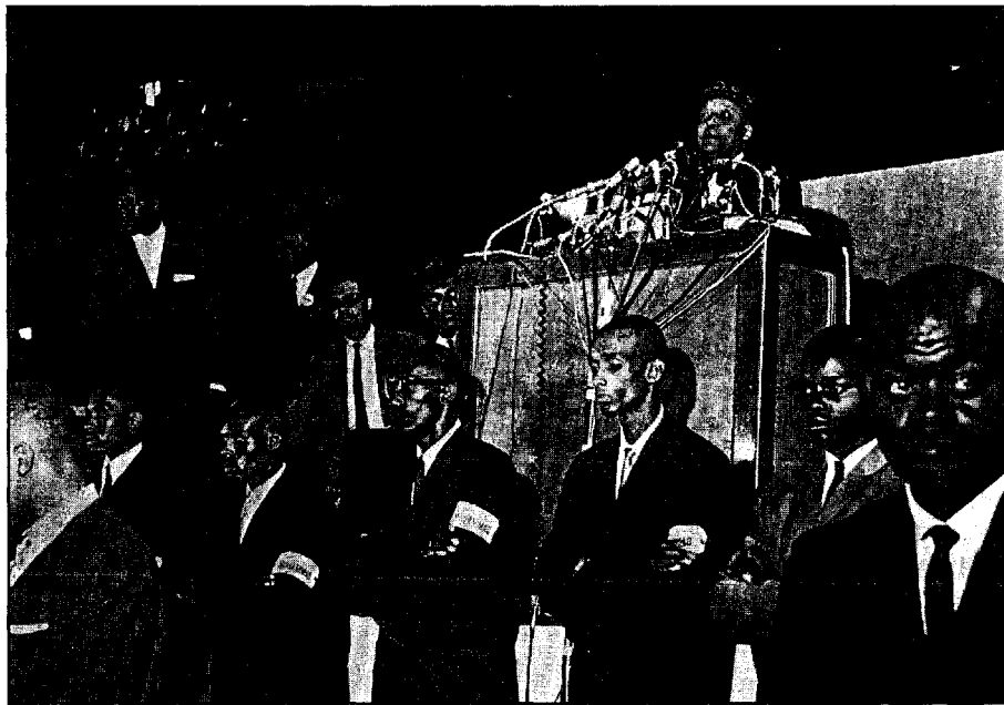
Elijah Muhammad and Nation of Islam Members.

cite one example, members of the African Methodist Episcopal (AME) Church, according to one scholar, "believed that the ability of Japanese to compete with Europeans and Americans on their own terms dispelled the myth of white superiority. Thus, AME leaders wholeheartedly supported the Japanese in the war against Russia. . . . Japan fascinated church members, who demanded information on every aspect of Japanese life and culture." 10