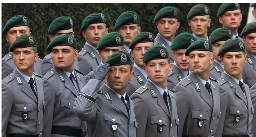
Recruits of the German army sworn in in Berlin, 20 July 2000

The decline of conscription is a key element in the transformation of European armed forces since the end of the Cold War. The majority of EU member states have introduced professional all-volunteer forces (AVFs). The reasons for this trend are both military and societal. Given today's geostrategic environment and the resulting task spectrum of European armed forces, the shift to AVFs is a logical development. The transition, however, requires a range of thought-out measures to secure appropriate recruitment levels and make the armed forces competitive on the labour market.