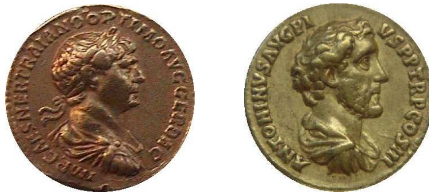
Figure 2: Left: Trajan aureus, Vienna Kunsthistorisches Museum. Right: Antoninus Pius aureus (minted during Ptolemy's lifetime), DIO Collection.

N6 Ptolemy admits ( GD 1.24.1) that his 2-1 rectangle isn't quite exact (§N2): the rectangle's width is only nearly [ \epsilon\gamma\iota\sigma\tau\alpha ] two-fold 55 its height. But: why only approximately twice as wide? Why not adjust Y such as to make the ratio exact? — since the priority here is suspected (§N10) to be The Split: a symmetric 2-1 rectangularly-bounded fan, for reasons either aesthetic (symmetry) or practical. (A portable map that is conveniently square after one protective fold?)