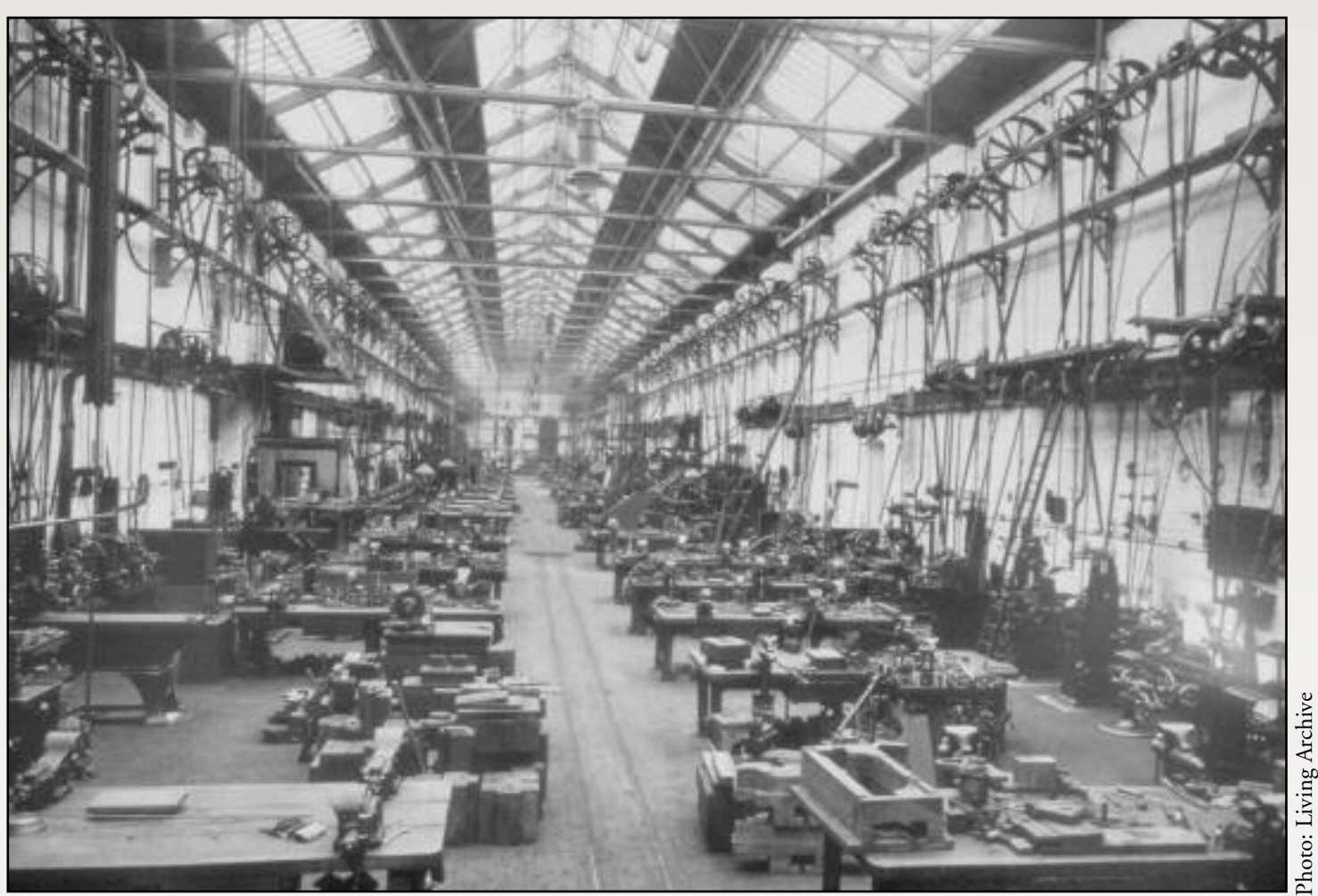
McCorquodales Printing Works interior