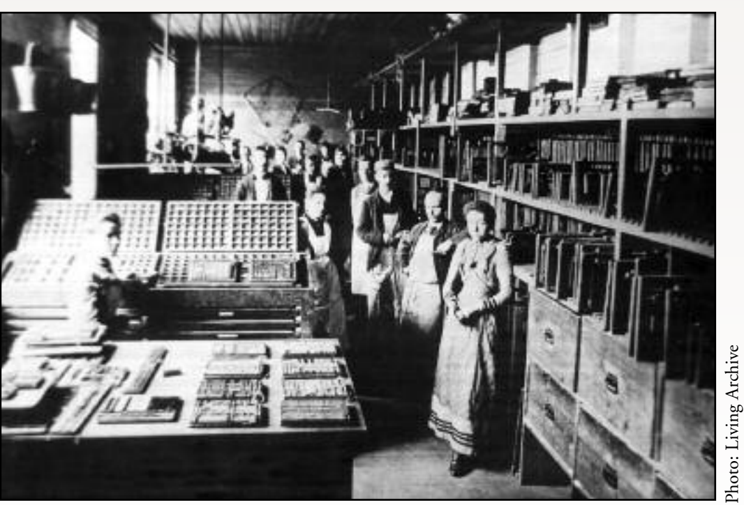
Staff in Composing Room at McCorquodales Printing Works, c1905