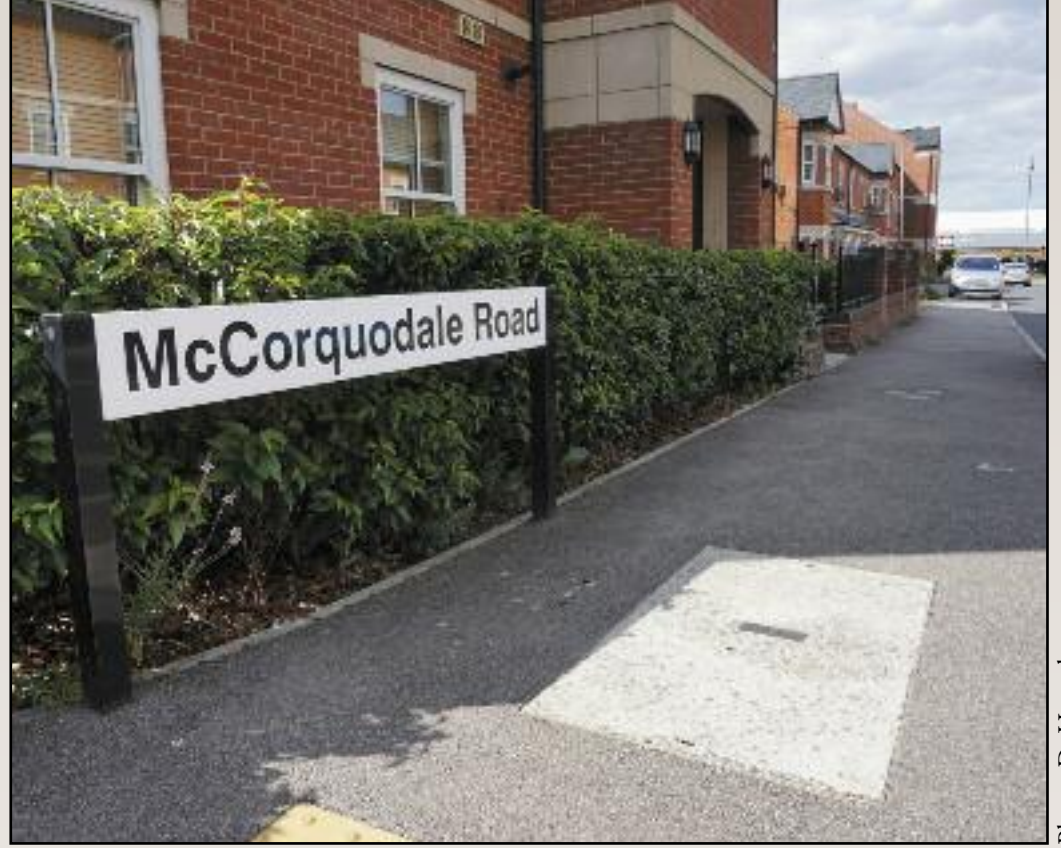
McCorquodale Road in Wolverton

McCorquodales Printing Works interior, c1905